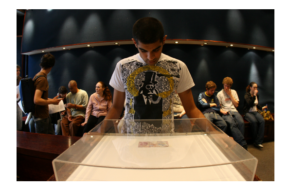
Figure 10. Cesar Pietroiusti, Money watching , 2007. Performance and social action at a Birmingham shop-front.

In another piece, Money watching (Figure 10), Pietroiusti used the auspices of a storefront gallery in Bristol to open a 'money store'. Passersby were invited to 'purchase' a £10 or a £20-note in return for, respectively, 15 or 25 minutes worth of undivided attention. The 'customer' was to stare at the note, placed in a glass display case, for half the duration per side, after which it was given to them. Here, Pietroiusti transforms the art event into (or perhaps reveals the art event to be) a scene of almost meaningless commercial transaction. By harnessing the 'customer' or audience's useless, immaterial labour, they become complicit in a ritual for creating value. This potentially reveals the nature of both aesthetic and economic value, and the way this arbitrary nature is enforced and encoded through spaces and objects: the disciplinary space of the gallery which encloses the meaning of art; or the aesthetic form of money itself which, unlike any other object, so seamlessly convinces us of its value.