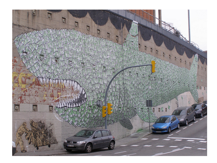
Figure 2. Blu, Money shark, 2010.

particularities of local public surfaces, and a keen but subtle attention to political-economic circumstances.