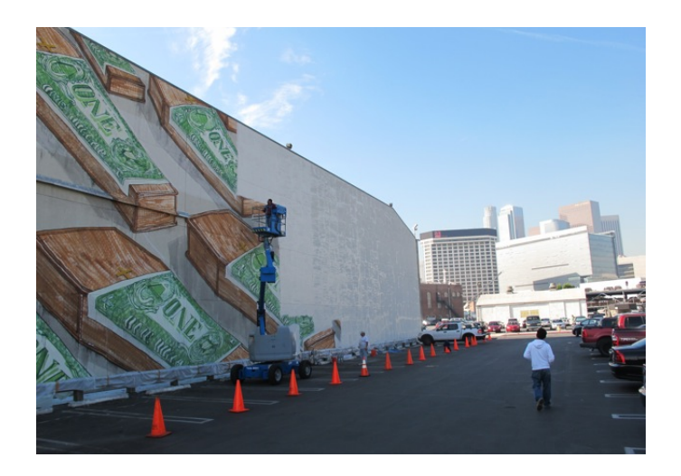
Figure 3. Workers whitewash a mural by the Italian street artist Blu at the Museum of Contemporary Art in Los Angelis, 9 December 2010.

For instance, in a well-known piece 2010 piece, Blu covered a tapering wall in Barcelona in the image of a massive shark composed of dollar bills – a grim commentary on the paroxysms of austerity forced on Spain as a result of the global financial meltdown (Figure 2). In another 2010 piece, Blu created a mural on the side of a satellite location of the Museum of Contemporary Art in Los Angeles depicting wooden coffins draped in American dollar bills in a fashion reminiscent of the pageantry, ritual and propaganda of military funerals (Figure 3). Citing the potential offence the mural might cause to visitors to a near-by war memorial, the museum had the piece whitewashed within 24 hours.