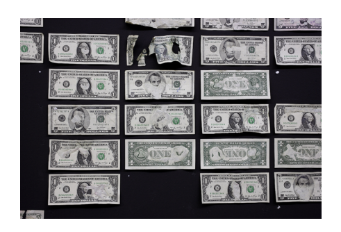
Figure 8. Cesare Pietroiusti, Untitled (Three thousand US dollars to take away) , 2008. Detail from installation and performance.

The bills were hung on the wall of the gallery and visitors were encouraged to take them as souvenirs. Here Pietroiusti draws the audience into a speculative and actual set of relationships with money. This complex, multi-layered piece, which deconstructs the value of both art and money is not simply satisfied to reveal their contradictions and ironies, as per strategy two. Rather, Pietroiusti is mobilising art's peculiar location at the intersection of multiple forms of value to create a temporary space where, for a moment at least, we can pay attention to the work we are all always already doing to reproduce capitalist social relations, taking advantage of the friction generated between money and art's representational qualities and social roles.