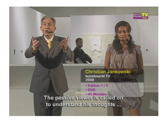
Figure 4. Christian Jankowski, Kunstmarkt TV, 2008. Video (still).

A second strategy, by contrast, seeks to show that art is not only sullied by but also complicit in money's terrible power. Work in this idiom attempts to reveal the deeper intersections of art and money, either in the historical or the contemporary frame. Unlike the first strategy, whose earnest interventions in some sense rely on the myth that ('real') art's guiding values are antithetical or at least resistant to market domination, this second strategy places such a mythology squarely within its sights. The politics here are largely deconstructive and, for that reason, court a sense of irony. As such, this strategy has at least two angles, one that I find laudatory, the other I find despicable.