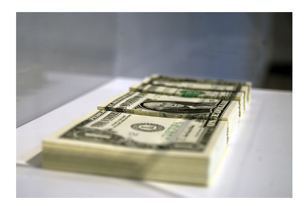
Figure 5. SuttonBeresCuller, Distribution of wealth, 2009. Installation. Courtesy of the artists.

to enter with him into a self-conscious performative deliberation on the value of money and art (see Weschler, 1999).