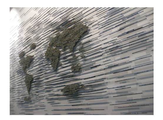
Figure 11a. Máximo Gonzáles, Numismagia , 2011. Side view. Out-of-circulation money, wooden sticks and pins.