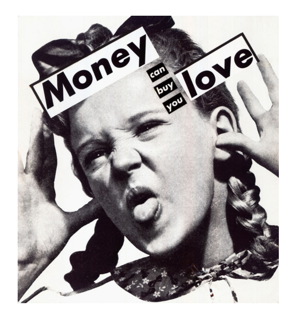
Figure 1. Barbara Kruger, Untitled (Money can buy you love), 1985. Collage.

In light of all this, the first critical strategy is a relatively naked attempt to use art's particular gravitas to comment on money's social and political power. If art, somehow, has – at least in myth, if not in fact – survived the neoliberal subordination of all spheres of social value to money's measure, perhaps art can mobilise that tenuous relative autonomy to reveal and expose money's authority that is otherwise insidiously normalised. Here I'll take two examples.