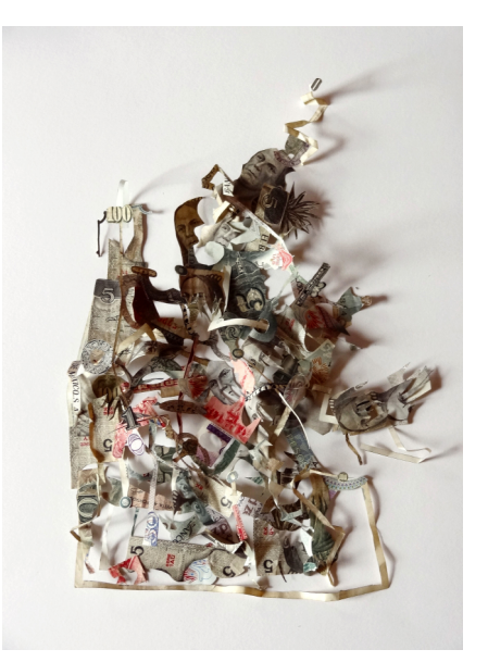
Figure 13. Máximo Gonzáles, Basura sin paisaje (Landfill without landscape), 2012. Detail. Out-ofcirculation money. Courtesy of the artist.

In several recent pieces, Gonzáles has experimented with punching holes in and stitching together money, almost to the point of its total dematerialisation (Figures 13 and 14).