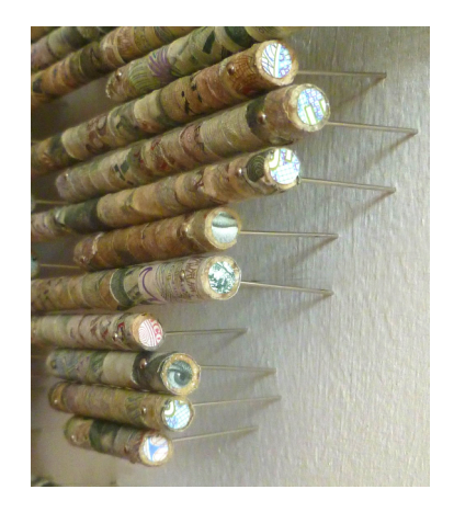
Figure 11b. Máximo Gonzáles, Numismagia , 2011. Detail. Out-of-circulation money, wooden sticks and pins. Courtesy of the artist.

Figure 11a. Máximo Gonzáles, Numismagia , 2011. Side view. Out-of-circulation money, wooden sticks and pins. Courtesy of the artist.