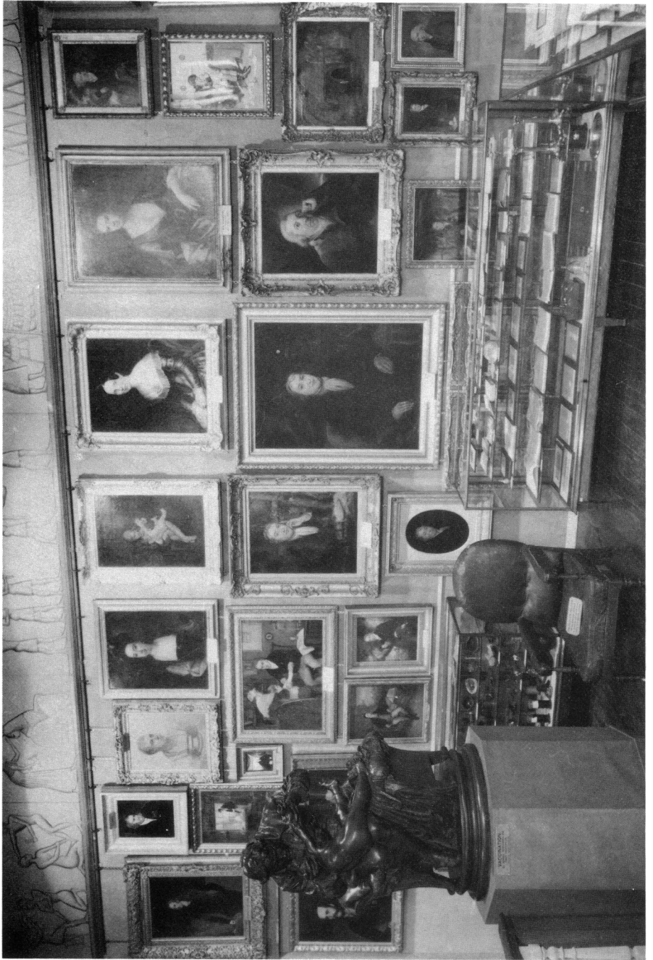
Plate 2. The Jenner section of the Wellcome Historical Medical Museum, c. 1920s.