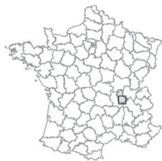
Fig. 1. The distribution of clusters of low (full triangle) and high (star) prevalences of the four pathogens detected in rats trapped in the Rhône department, France.

*Sample size: small=[1-6] rats; middle=[7-12] rats; large=[13-23] rats