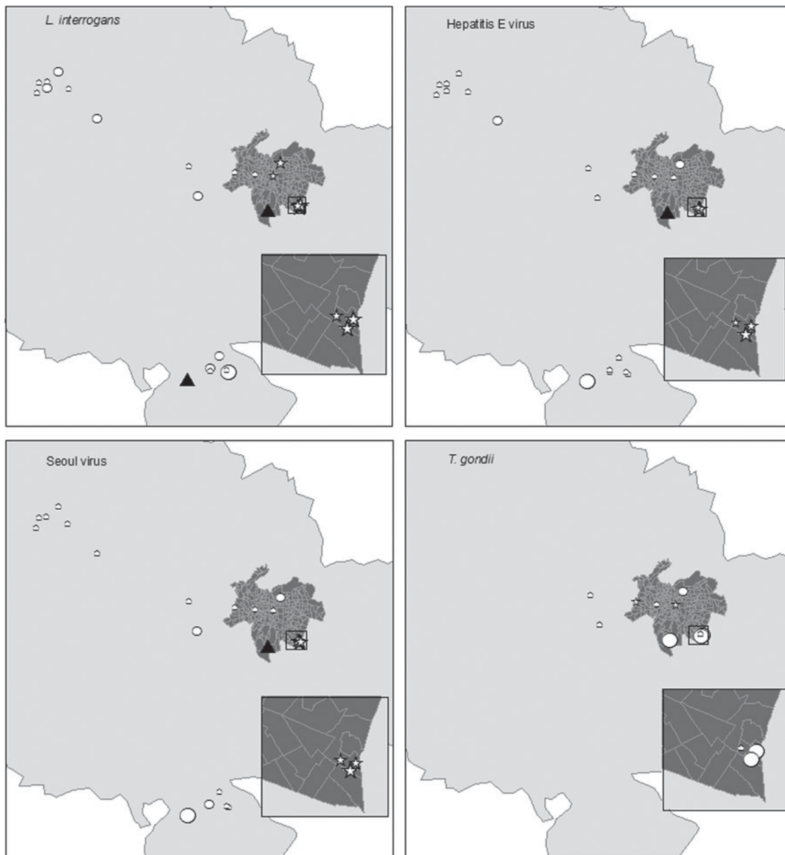
Distribution of infected rats in the Rhône including the city of Lyon

Sample size* Small Medium Large ☆ ☆ ☆ High level of infected rats ▲ ▲ ▲ Low level of infected rats ◊ ◊ ◊ Not significant ■ Lyon city centre □ Rhône department