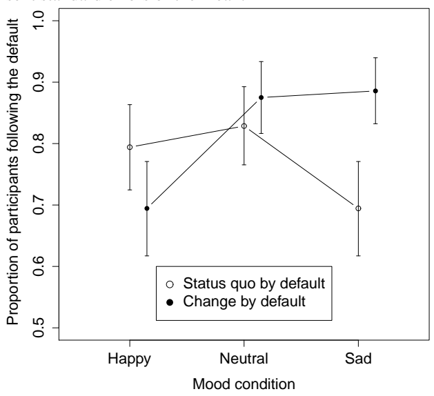
Figure 3: Proportion of participants following the default by type of default and mood condition. Error bars represent standard errors of the mean.

ticipants in the happy condition were more excited than participants in the neutral condition (p = .004), but did not differ from them in their ratings of anger and curiosity. There were no differences in how jittery participants felt. Mean and standard deviations of all affect measures can be found in the Appendix.