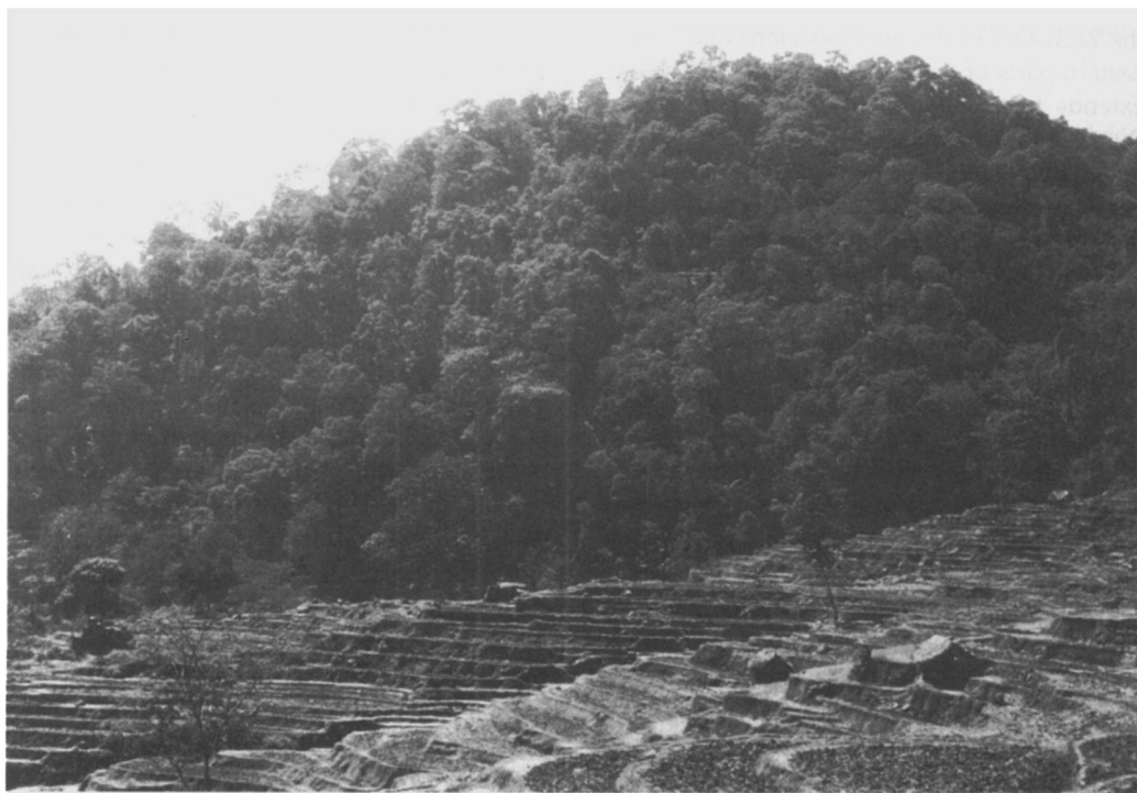
The Dieng Mountains, Central Java. A view of the lowland forests near Linggo, with areas cleared for wet rice fields in the foreground.

Asian primates (Eudey, 1987), and has recently been listed as Critically Endangered by IUCN (1996).