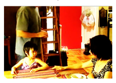
FIGURE 6. Extract 3 line 20