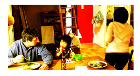
FIGURE 9. Extract 5 line 10

10 Mom: turn to stands up, goes to kitchen to fetch water