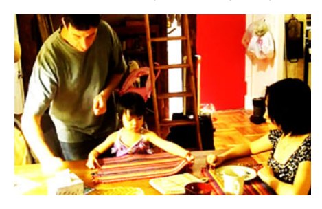
FIGURE 5. Extract 3 line 19

no one would talk to you that way. okay?=