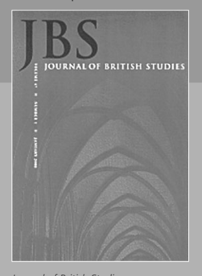
Journal of British Studies

For more information, please go to http://journals.cambridge.org/JBritStud