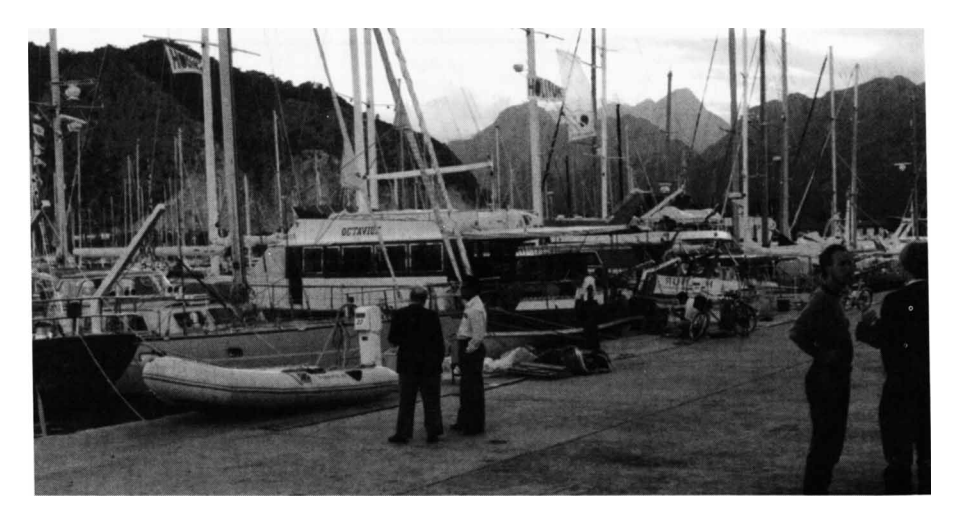
Marina at the site of the conference banquet.