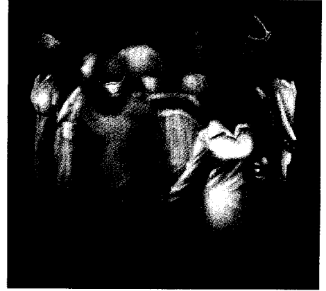
From the SURGIKOS Art Collection. Artist Debbie Kuhn's interpretation of protecting patients from nosocomial infections. This original art was featured in ASEPSIS* The Infection Control Forum, Volume 2, Number 6, November-December, 1966.

Forum, Programmed Instruction in Asepsis, and other educational programs are just some of the reasons why SURGIKOS is the infection control company.