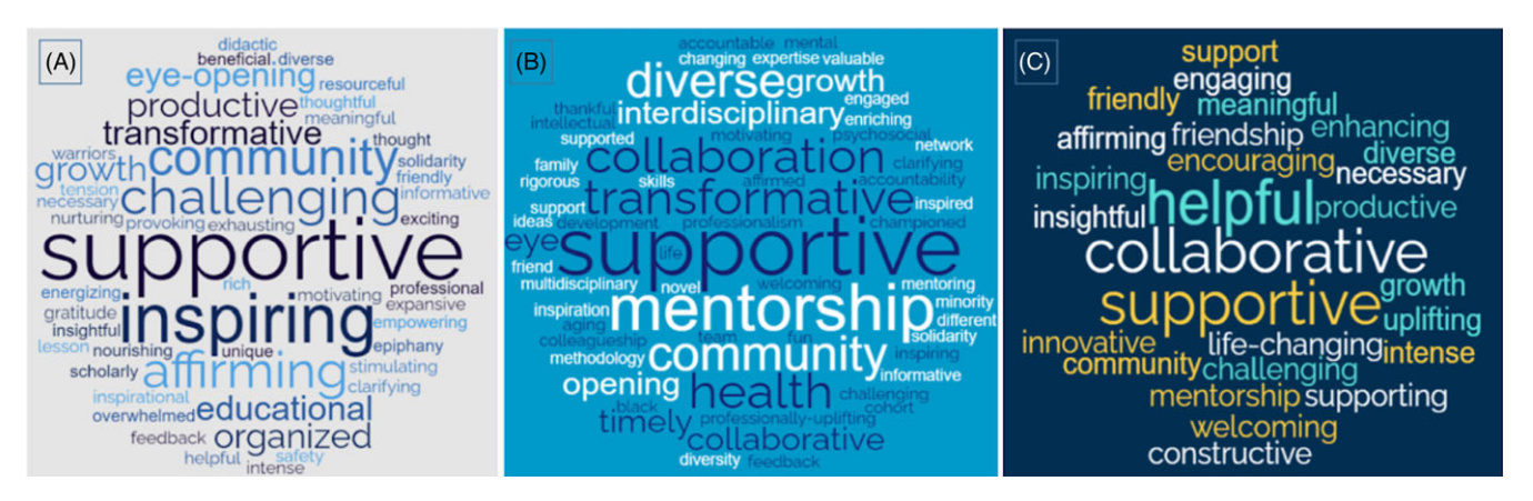
Figure 3. Qualitative evaluation of cohort 1 experiences in the MIWI Training Program (2020–2022). Word clouds created from anonymous responses from Scholars to the prompt "What are the first five words that come to mind when thinking of your experience in MIWI?" Panel A: Immediately following the virtual institute in June 2020 (n=15); Panel B: At program conclusion in April 2021 (n=15); Panel C: Two years after program acceptance in April 2022 (n=7).