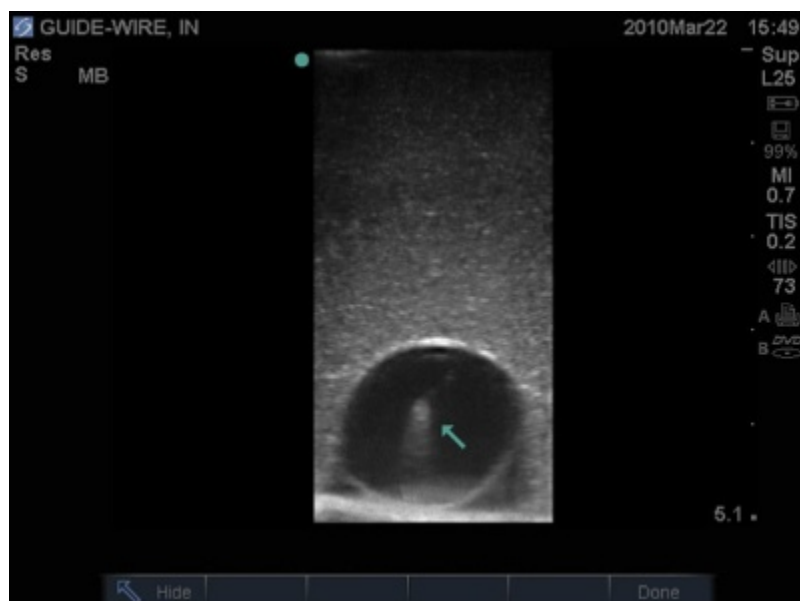
Figure 3. The guidewire (arrow) shown in a transverse imaging plane in a simulated vascular access model.

Sonosite M-Turbo (Bothell, WA) with a 6 to 13 MHz 25 mm linear array transducer to determine the location of each guidewire relative to the vein. Participants recorded their responses as “inside,” “outside,” or “unsure” on a data collection sheet. No instructors or other participants were allowed near the testing station while the examinee scanned the testing model and completed the data sheet. Subjects were asked not to discuss the examination until all participants had undergone testing. The test characteristics were determined using known wire position as the criterion standard.