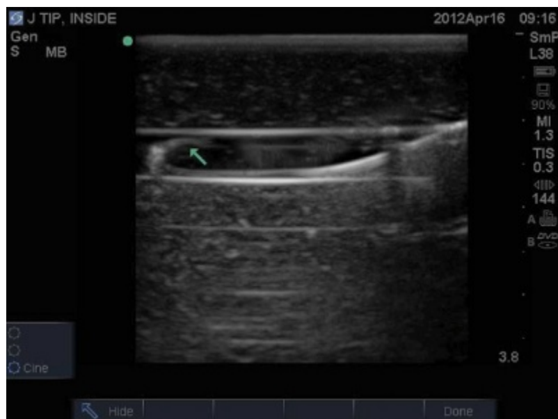
Figure 4. Longitudinal view of the guidewire in a vascular access model with a J tip (arrow) observed within the vessel.