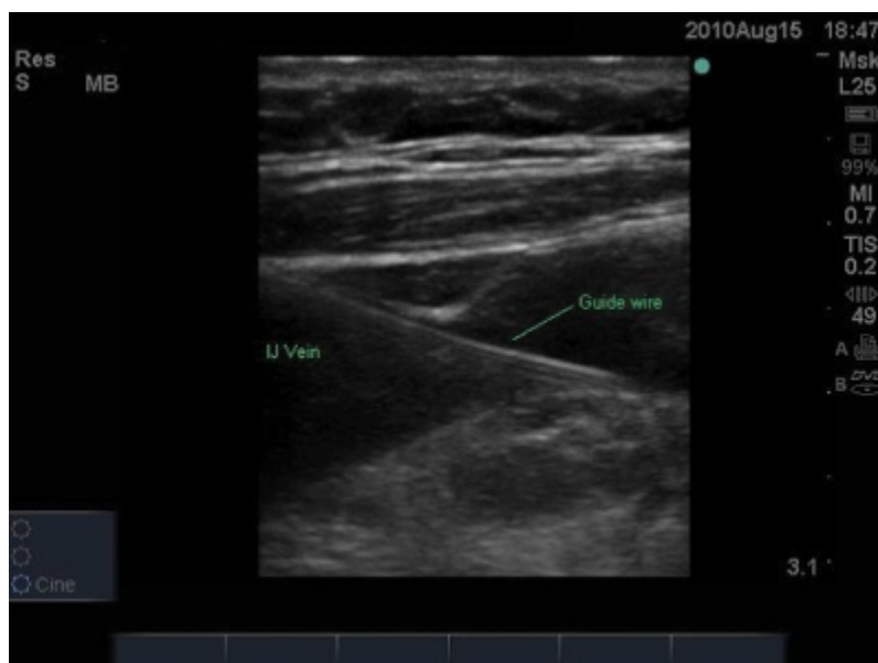
Figure 1. Guidewire visualized sonographically within the internal jugular (IJ) vein in a longitudinal imaging plane.

Participants were given a 5-minute demonstration on guidewire visualization followed by hands-on training with an inanimate vascular access model. The model was constructed using water-filled latex (Penrose) drains to simulate veins inside an opaque, congealed gelatin-psyllium mixture, as previously described. 12 Each simulated vein was 3 cm below the surface of the model and had an accompanying guidewire positioned either correctly within the vessel or incorrectly outside it. Participants were taught to visualize each wire in both longitudinal (Figure 2) and transverse (Figure 3) scanning planes. After watching the instructor demonstrate the appearance of correctly and incorrectly positioned wires, trainees were allowed to practice on the vascular access model. Each trainee scanned one simulated vein with an improperly placed wire and between one and four veins with properly placed wires. Trainees were advised to