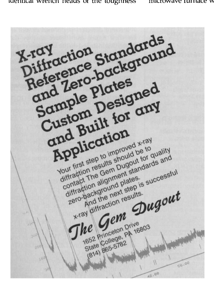
Circle No. 9 on Reader Service Card.