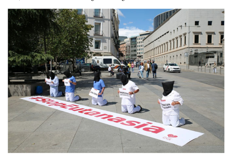
Image 1. Anti-euthanasia concentration of the Right to Live Platform (anti-abortion branch of CG-HO) in front of the Spanish Congress, Madrid, 2019