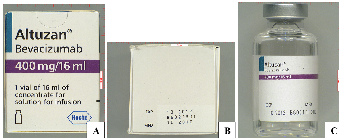
Figure 1. Counterfeit Altuzan® carton (A), carton lot/expiration (B), vial/vial label (C).