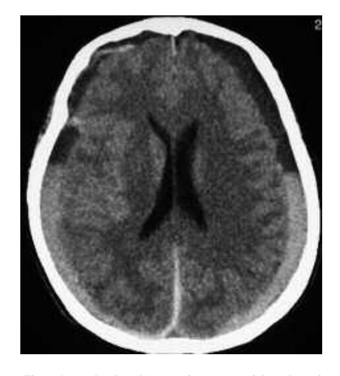
Figure 1: Uninfused axial CT scan demonstrating bilateral mixed density subdural collections consistent with acute on chronic subdural hematomas.

Tension pneumocephalus occurs in 2.5% to 16% of patients following evacuation of a chronic subdural hematoma.<sup>1,2</sup> It has been reported to occur in a variety of situations including, but not limited to: 1) posterior fossa surgery in the sitting position, 2) use