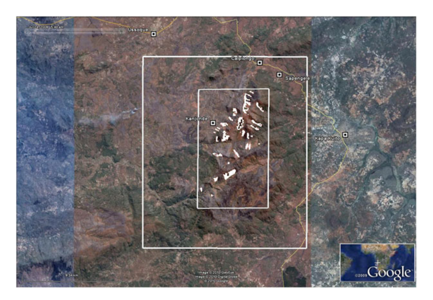
Figure 1. A Google Earth (2009) satellite image of the Mount Moco study area, showing all forest patches > 0.5 ha in extent as white polygons, and the settlements of Ussoque, Kanjonde, Calpiongo, Sapengele and Kapa Kuito. The inner white rectangle covers c.7,215 ha and includes all current forest cover, whereas the larger rectangle, which we propose forms the boundaries of a conservation area, covers c.27,000 ha of Afromontane forest, Brachystegia woodland and montane grassland, and would allow for the expansion of montane forests towards their previous extent. These areas are bounded, respectively, by the points 12.400°S 15.140°E in the north-west and 12.500°S 15.200°E in the south-east, and 12.373°S 15.092°E in the north-west and 12.534°S 15.233°E in the south-east.