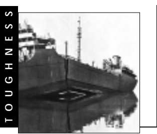
Crack open the mystery of how the Titanic and other ships failed.