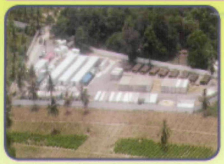
Thai Tsunami Victim Identification Centre