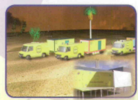
All kinds of Mobile Clinics