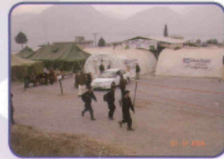
Cuban Hospital, Muzaffarabad, Pakistan