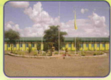
KATIKO Referral Hospital, Southern Sudan