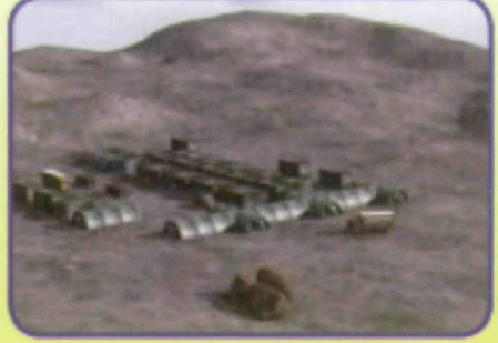
Norlense inflatable tents