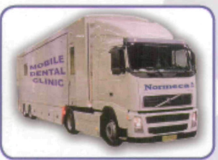
All kinds of clinics or hospitals in MultiSpace