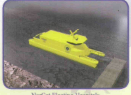
NorCat Floating Hospitals