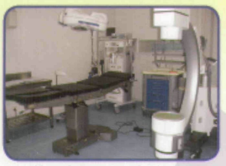
Inside OT in KATIKO Referral Hospital