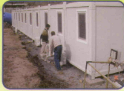
MSF Hospital, Hattian Bala, Pakistan