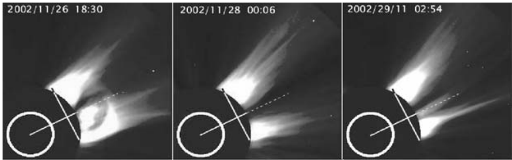
Figure 1. The coronal morphology in the North-West quadrant as seen by LASCO/C2 coronagraph from the beginning (left panel) to the end (right panel) of UVCS observations; in the figure we show also the position of the UVCS slit.

In this work we focus on CME data acquired over \sim 2.3 days by UVCS instrument during the SOHO–Sun–Ulysses quadrature (Suess et al. 2000; Poletto et al. 2002; Bemporad et al. 2003a; Suess et al. 2004) of November 2002. In section 2 we describe the post–CME evolution as seen in LASCO and EIT images, while in section 3 we describe the UVCS observations and data analysis. The origin for the high temperature plasma observed by UVCS is discussed in section 4, while in section 5 we focus on the comparison with Ulysses in situ data. A short discussion of our results concludes the paper.