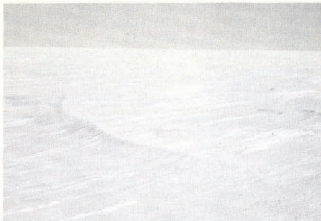
Fig. 3. A small conical (upper right) and several sinuous ice blisters observed in the Katakaturuk River delta, Camden Bay, Beaufort Sea coast, Alaska, in 1980.

Koettlitz Glacier Ice Tongue nor on the Jakobshavns Isbræ ice field.