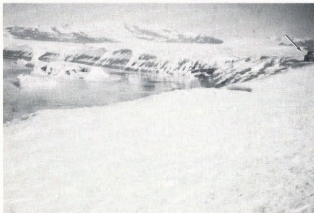
Fig. 1. River of meltwater on Koettlitz Glacier Ice Tongue. The dark blotches in the river are granular material resting on the ice bottom. A small 1 m high tracked vehicle is at the tip of the arrow. Dark bands in channel wall are related to ice-fabric variations.

I saw similar ice blisters on Koettlitz Glacier Ice Tongue, Antarctica, in 1977. During the ablation season, significant surface melting occurs on this ice tongue. In some years, the melting is so severe that "rivers" of rapidly flowing water develop and erode deep channels in the ice surface (Fig. 1). The steep ice walls of the channels were up to 6 m above the water in the areas of study. A truly unique aspect of this flow is that it ran along the spine of the ice tongue back toward the area where the glacier ice becomes free-floating rather than toward the front of the ice tongue and into McMurdo Sound. The ice blisters observed were either cone-shaped (Fig. 2) or sinuous mounds. All were of the solid type in that they