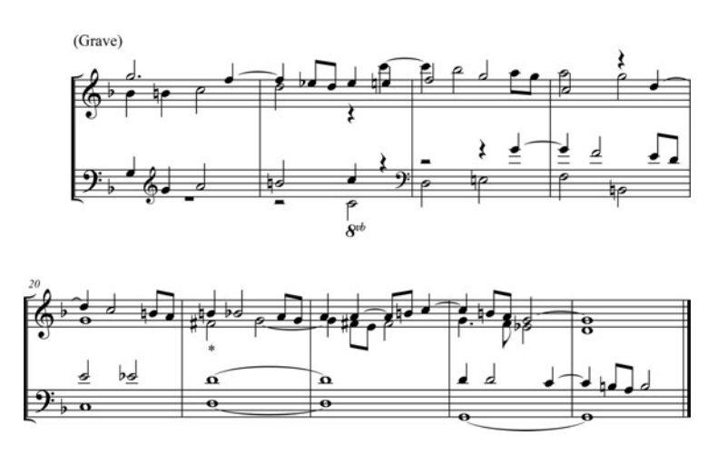
Example 2 Alessandro Scarlatti, Concerto No. 4 in C minor, second movement, bars 16–24 (bass figures omitted) (London: B. Cooke, 1740).

in the familiar order: the volume is a binder's collection opening with two published sonata collections by the Scottish violinist-composer William McGibbon (1696–1756) and ending with manuscript copies of seven unidentified sonatas and the Scarlatti bass parts.