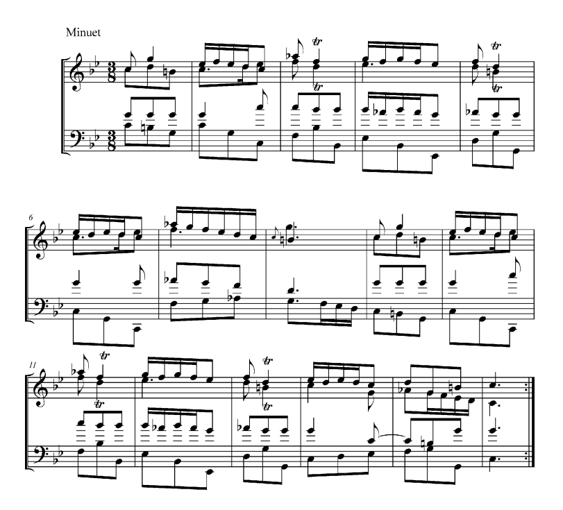
Example 1b Charles Avison (?), under the name of Alessandro Scarlatti, Concerto No. 2 in C minor, final movement, opening section (bars 1–16; bass figures omitted).

Scarlatti's original minuet was conceived as a brief adjunct to the full-length movement in \frac{3}{4} time that preceded it: the coffee following the dessert, so to speak. It is quirky and jerky in a typically Scarlattian manner. Its emphatic juxtaposition of iambs and trochees, all the stronger for the slightly unexpected near-literal repetition of bars 1–4, is very characteristic, and the move to a half close at the end of the section is exactly what one would expect in a very short binary movement.