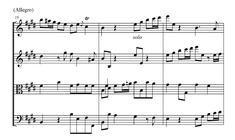
Example 4 Francesco Scarlatti, Sonata No. 1 in E major, first movement, bars 18-20

which, to complete the subject, was altered to the paired quavers b^1 and b. In the Cooke edition, where the violas are treated throughout as an undivided ripieno part, the viola retains the imitative entry on the first three beats of bar 19 (with no tell-tale natural for the a^1 ), but the crotchet f\sharp^1 on beat 1 falls.