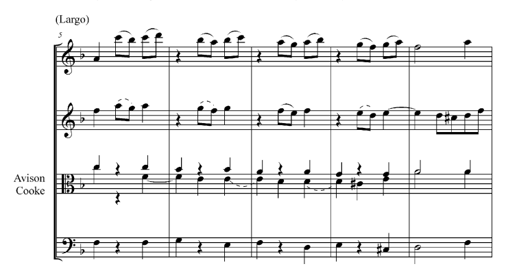
Example 6 Francesco Scarlatti, Sonata No. 8 in F major, second movement, bars 5–9. Newcastle City Library, Avison Workbook I. Used by permission

in Geminiani's possession, they are very rare & fine'.<sup>70</sup> The supposition that Avison acquired the music from Geminiani, who joined Francesco in Dublin in 1733, is at least plausible, and fits the estimated date of the