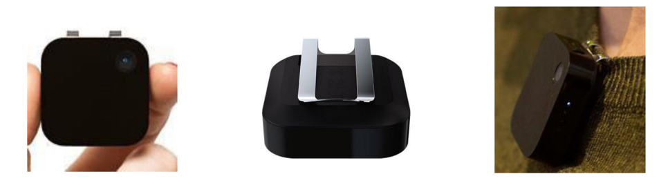
Fig. 1. Visual image of the Narrative Clip<sup>(30)</sup>

for viewing. While the images were being uploaded, a 24-h recall interview was conducted with the participant. The 24-h recall consisted of three steps: Step (1) an initial quick list of everything the participant had eaten throughout the day, followed by Step (2) a more in-depth review of food consumption including: type of food eaten, location of where the food was consumed, amount of food, cooking methods used to prepare the food and whether the food was eaten alone or with other people. To improve accuracy, participants were shown photographs of different portion sizes to assist in quantifying the amount of food eaten<sup>(31)</sup>, Step (3) was a final review of food items and amounts recalled.