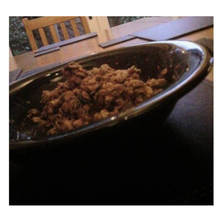
Fig. 3. Example of food images captured by the Narrative Clip.

However, two participants (10 %) stated that the camera made them more conscious of what they ate and that they tended to snack less when wearing the camera. They also noted that they were conscious that everyone could see the device if they were in a public location. While the majority (n \ 13, \ 65 \ \%) of participants felt that the camera did not invade their privacy, some (n 7, 35 %) highlighted that use of the camera while using the bathroom and also in public situations was invasive. Nine participants also stated that they were conscious of the wearable camera throughout the day, especially in terms of whether the camera was positioned correctly to capture all food intake. Two participants also reported that the camera moved throughout the day or physically fell off their clothes. When viewing the images, the researcher also noted that some images were obstructed, for example due to hair, clothing and movement.