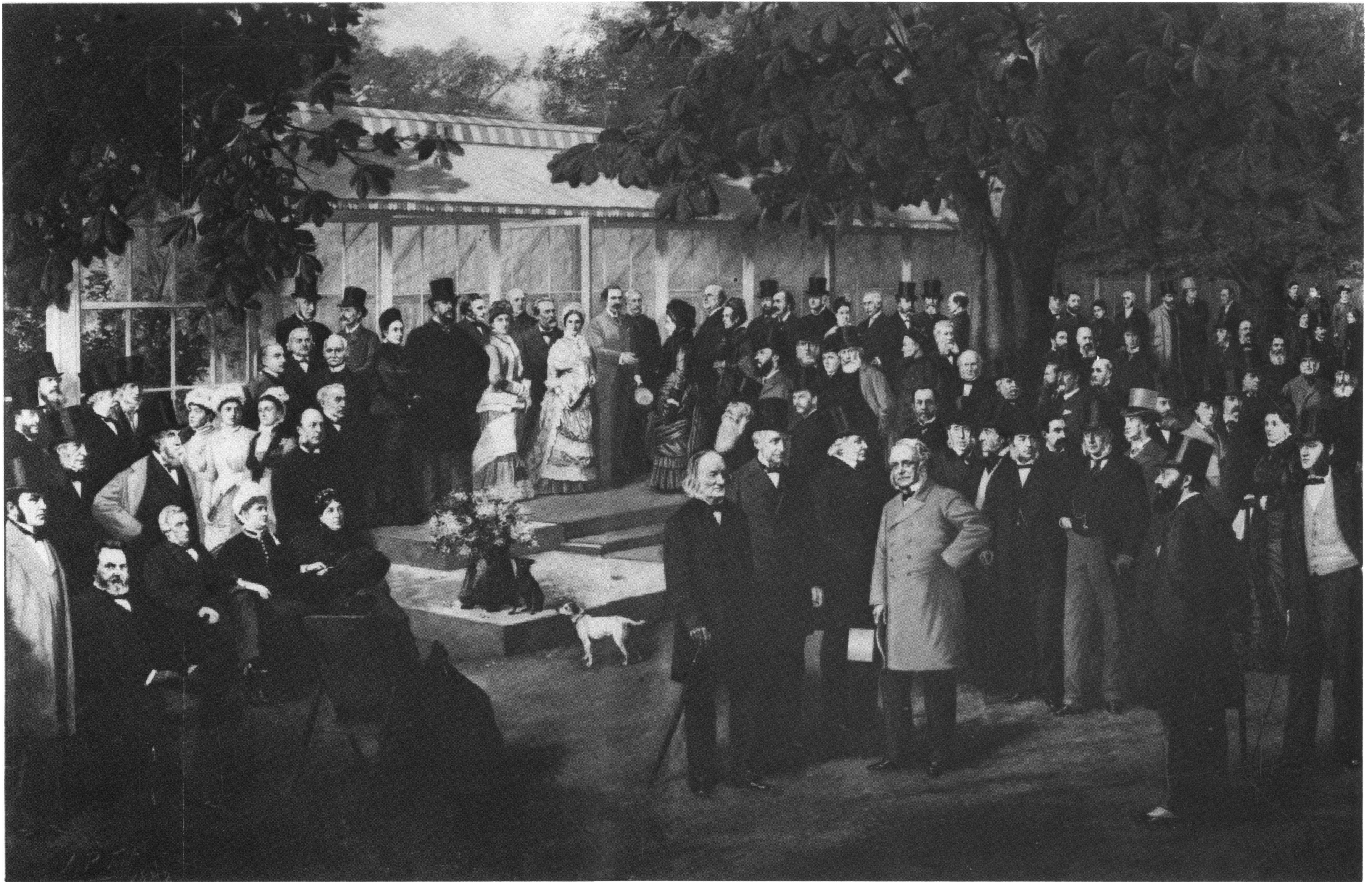
Figure 2. Baroness Burdett-Coutts' garden party, 1881. Artist: A. P. Tilt.