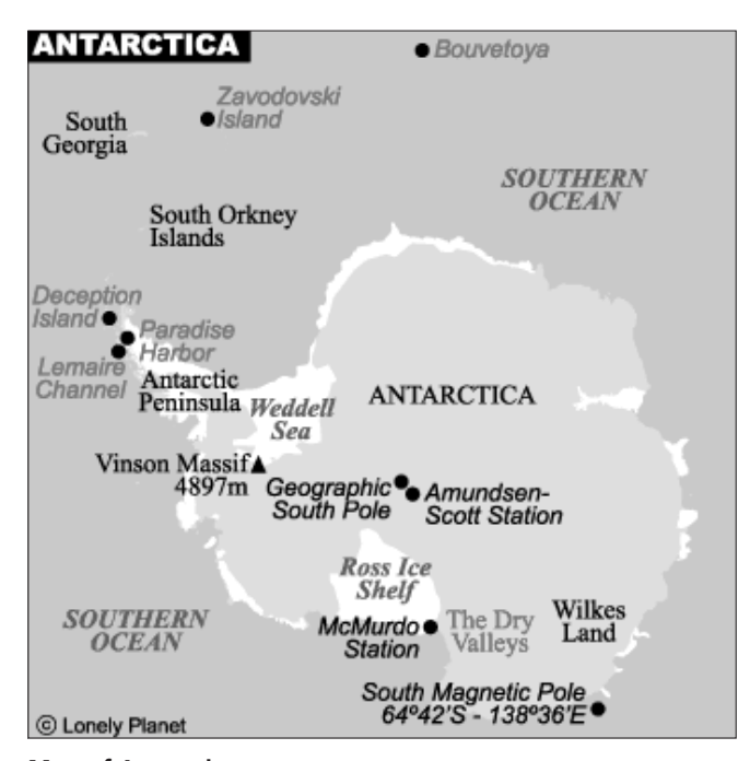
Map of Antarctica

peared one day and seemed to "play" with our ship. They did not appear to be feeding and we wondered if they were just "having fun." Humpbacks are slow-moving and easy targets for hunters. Grytviken, where Shackleton is buried, on South Georgia Island, was the largest whaling station in Antarctica, and many marine species were decimated in the region. Now the humpbacks, like many other Antarctic animals, are protected. Whale and seal numbers have recovered somewhat from the days when hunting was allowed.