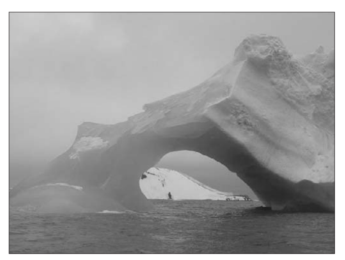
Old blue ice in Lemaire Channel

Numerous Antarctic research stations were built in the 1950s and most have a resident physician, because emergencies do happen. I met two physicians, an Argentinean at