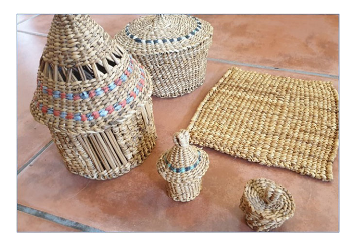
Figure 2. Examples of woven crafted objects made using the plant Cyperus textilis , locally known as imizi.

in the country and the worst national unemployment rate (47.1%), directly improving the income of several households within the Hamburg community and placing traditional knowledge bearers, mostly women in this case, at the epicentre of this creative production. Given that the artisanal practice of weaving is a dying practice, the intention is for the IMISEE project to boost the heritage value of this local innovation while providing a benchmark for the direct (and potential future) economic empowerment of the rural Hamburg community, while ensuring active and valued participation of local communities as co-creators of innovative science and promoters of principles of conservation of coastal biodiversity.