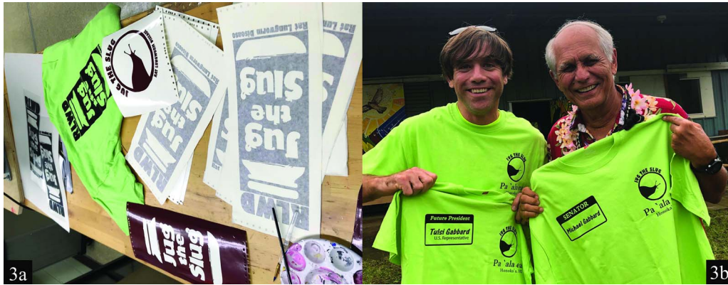
Fig. 3. (a) High school graphic arts students create RLWD prevention stickers and T-shirts with their 'Jug the Slug' logo. (b) High school graphics art teacher and PDE3 course participant presents Hawaii Senator Mike Gabbard with a t-shirt created by students.

data collection and ArcGIS story mapping. Hands-on activities, demonstrations, observations, collaborations and discussions similar to those described for the PDE3 course were conducted in a more condensed format.