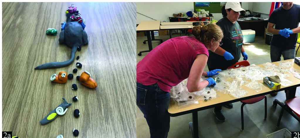
Fig. 2. (a) Teachers recreate the RLW life cycle using modelling clay. (b) PDE3 course instructor identifies slugs and snails captured during the hunt with course participants.

were identified. Teachers collaborated on a lesson development activity and wrote reflections at the end of each workshop day.