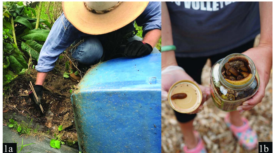
Fig. 1. (a) A teacher uses chopsticks to safely pick up slugs. (b) A jar full of Cuban slugs is captured during a slug hunt in a school garden.