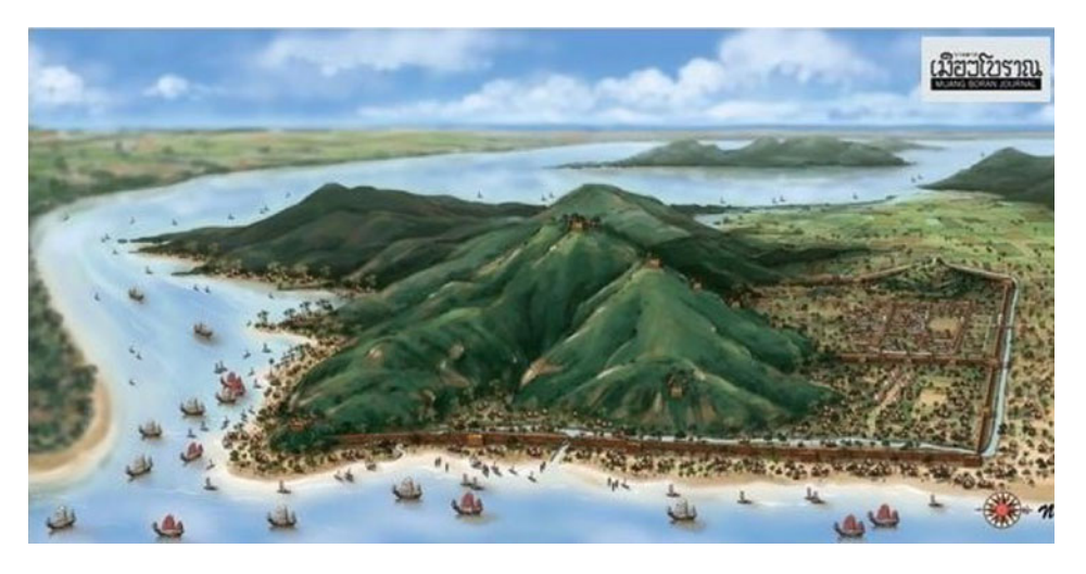
Figure 4. A contemporary sketch of Singora during the seventeenth century (Thongmit 2018: 3)

Several questions might be posed as a conclusion: What then does this revised narrative mean for the history of Singora? And what new insights can this analysis hold for the reconstruction of power dynamics in southern Thailand in the early seventeenth century? Two preliminary takeaways might be offered here in this context. First, Singora's early history and founding have much more to do with Nakhon Si Thammarat than previously assumed, and that more research could shed light on the complicated power struggles that eventually shaped the history of southern Thailand. While it is well established that Nakhon Si Thammarat is a city of considerable antiquity and importance, and helped enforce loyalty to the Ayutthayan kings of southern rulers during the fourteenth to the eighteenth centuries, its role has