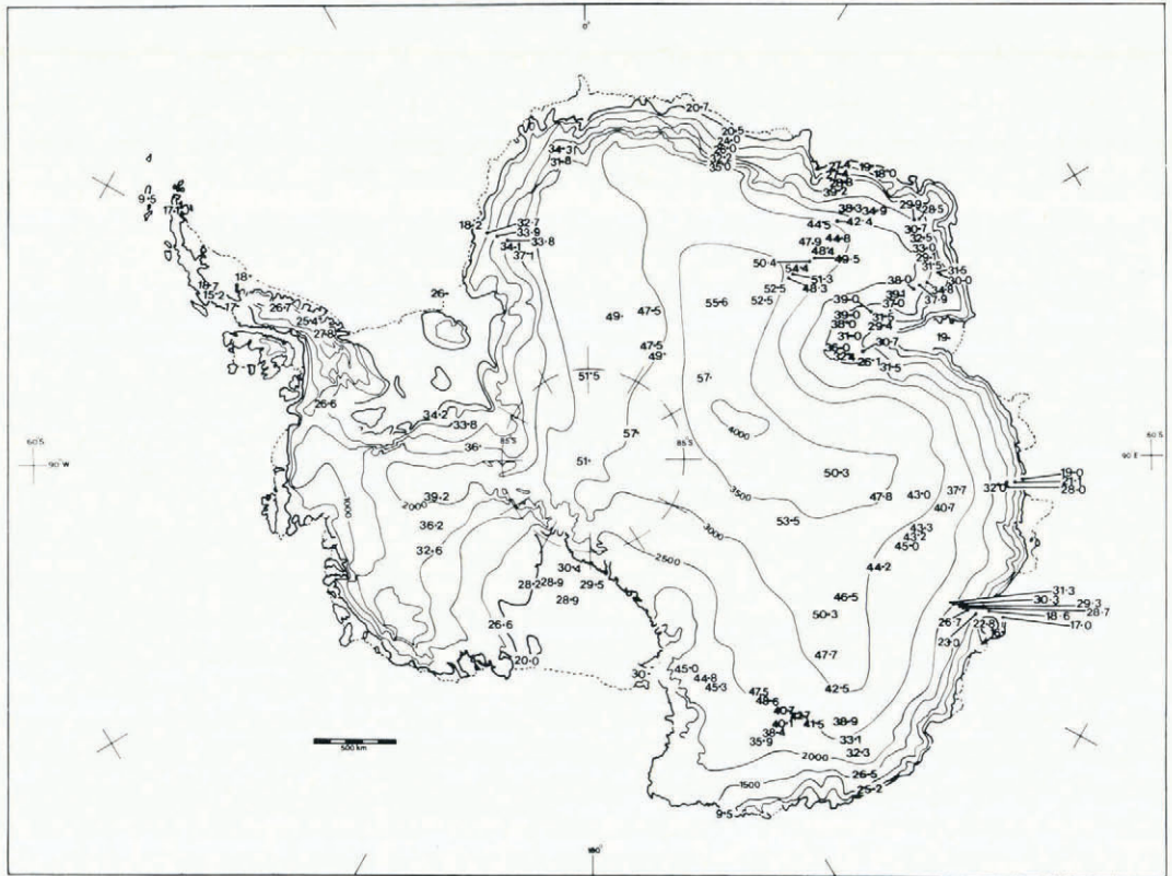
Fig. 1. Mean annual surface values of \delta^{18}\text{O} in parts per thousand obtained from measurements in Antarctica.