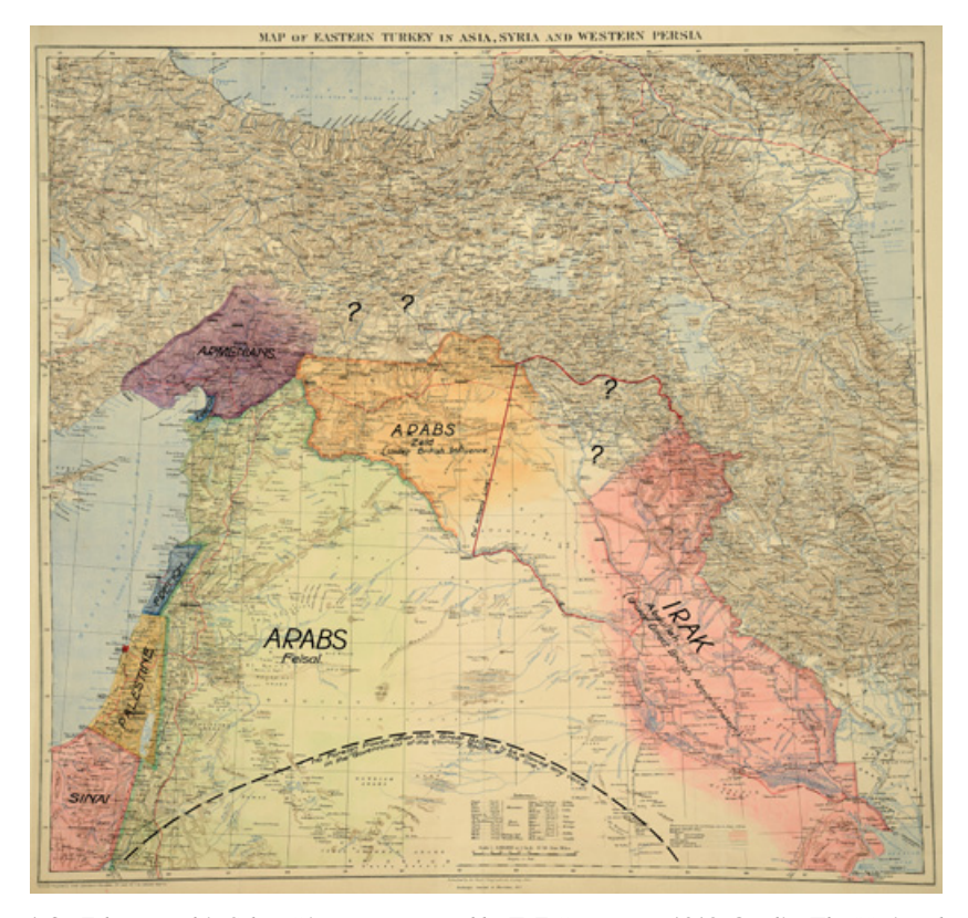
\label{eq:continuous} \textbf{1.2.} \ \ \text{Ethnographic Sykes-Picot map created by T. E. Lawrence, } 1918. \ \ \text{Credit: The National Archives (UK), ref. MPII/720(1).}

Even before the public knew about Sykes-Picot, the Foreign Office began to make use of the wartime imperial geography.