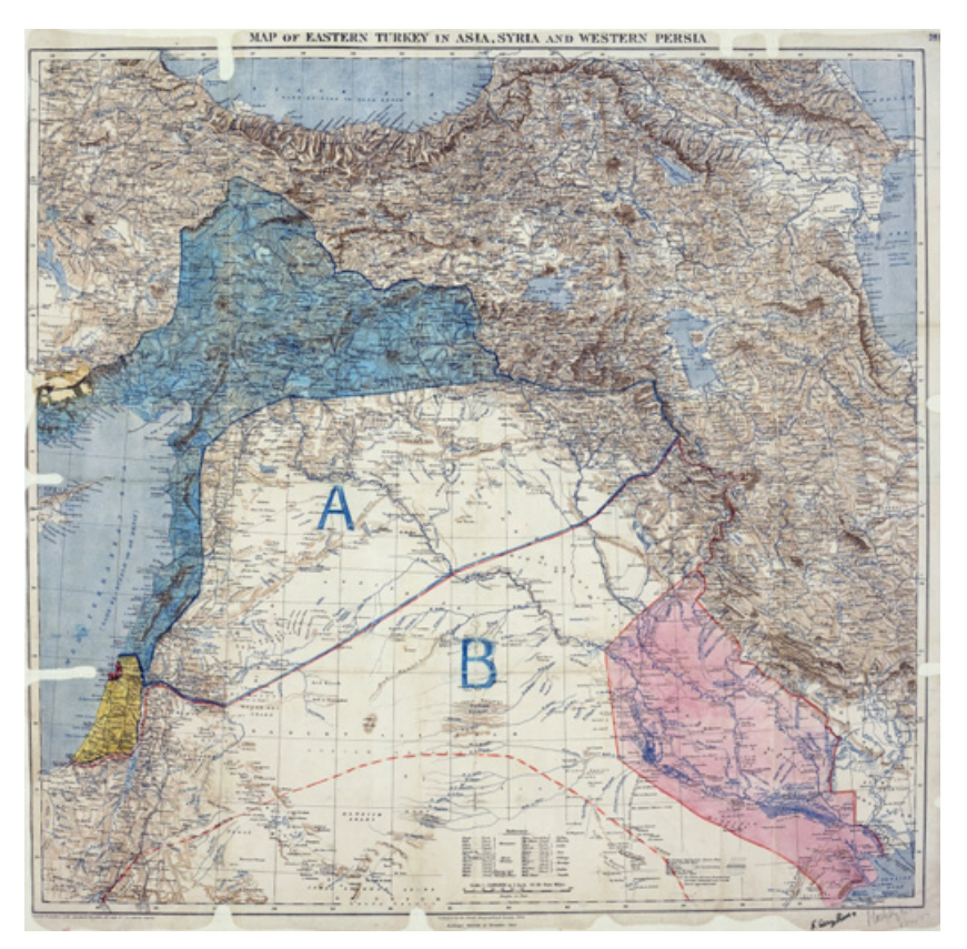
1.1. Sykes–Picot map to Illustrate the Agreements of 1916.

Mapping Mesopotamia as belonging to the West was central to Sykes' project. The Sykes–Picot map depicting the Middle East divided into imperial spheres of influence and client states continues to capture the western imagination today. The more well-known map designated the future spheres of influence of Britain and France (see Figure 1.1). 143