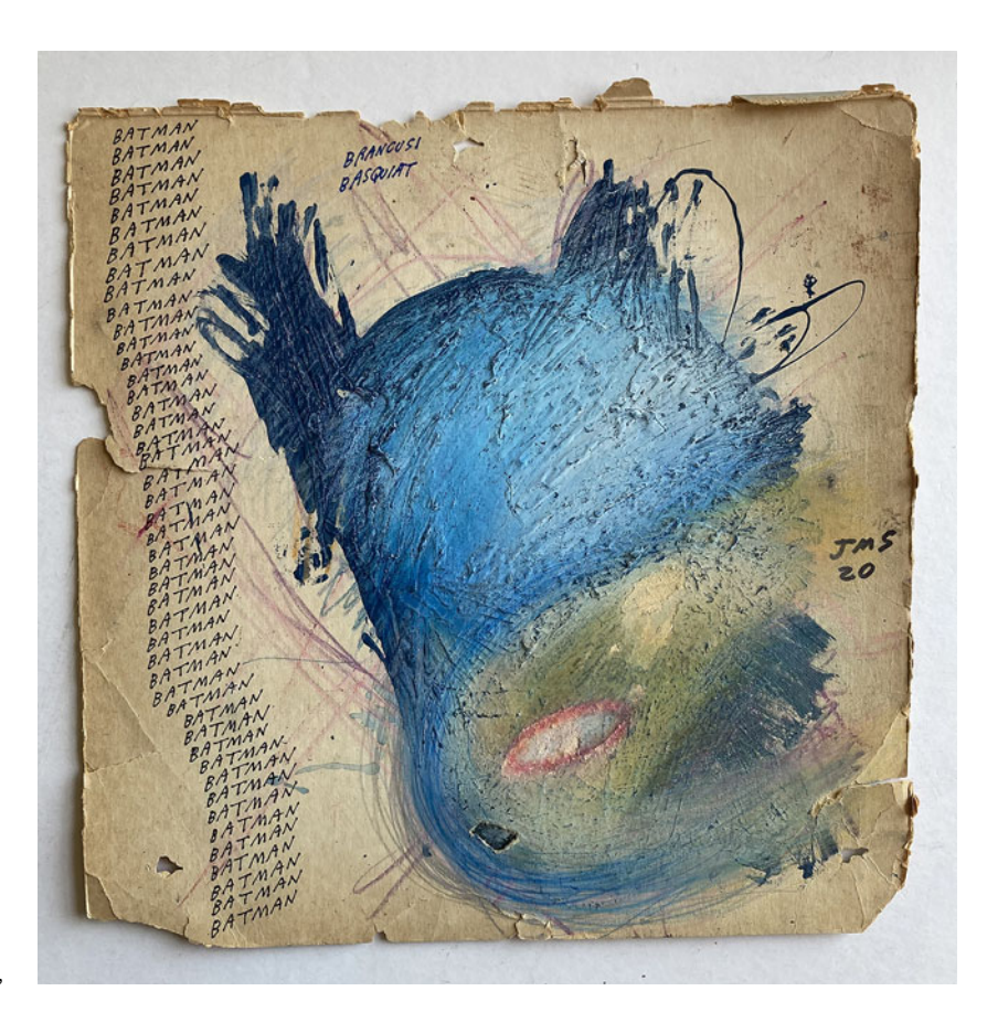
Figure 2. Jon Sarkin, Batman , 2020, mixed media on found cardboard, 31 x 31 cm.

unplayable and unsellable vinyl, he can obtain them in the kinds of quantity that allows him to work in series. Interested only in the unprinted insides of the covers, Sarkin tosses the unwanted vinyl in piles in his studio, where it accumulates until someone is willing to throw it away.