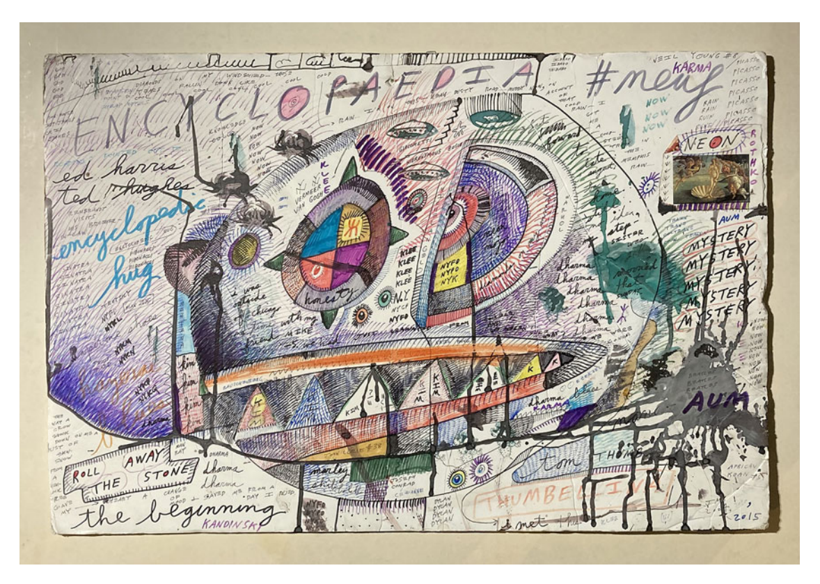
Figure 4. Jon Sarkin, Roll Away the Stone, (2015), mixed media on foamboard, 71 x 51 cm.

"adapted" and now the main insight I have regarding my transformation is ... the perception of mutually exclusive polar opposites as comfortably co-existing' Sarkin (2022e). In fact, there is no 'path' or