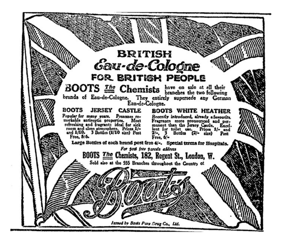
Figure 1—Advertisement for Boots the Chemists' "British Eau-de-Cologne for British People," Times (London), 21 October 1914, 6. Courtesy British Library Board, Shelfmark NRMMLD1.

the wartime context, and advertising copy declared perfumes as "confidently recommended for use in the sick-room," claiming there was nothing like it "for charming away headache and bracing fatigued and relaxed nerves." Here gender and race came to the fore, as these purported health properties extended to white male and female customers, as both recipients and providers of relief. Companies like London's Crown Perfumery advertised their lavender range as a "reviving and keenly stimulating remedy" for lightheadedness or "nervous headaches" experienced by white women in wartime Britain. From December 1914, firms like Gosnell and Zenobia advertised their eau de Cologne and "Real Old English Lavender Water" as "very delightful British perfumes" that were "refreshing and welcome gifts to the wounded and other invalids" (see figure 2). Meanwhile, the French firm Courvoisier argued in its English-language campaigns that perfume was appreciated