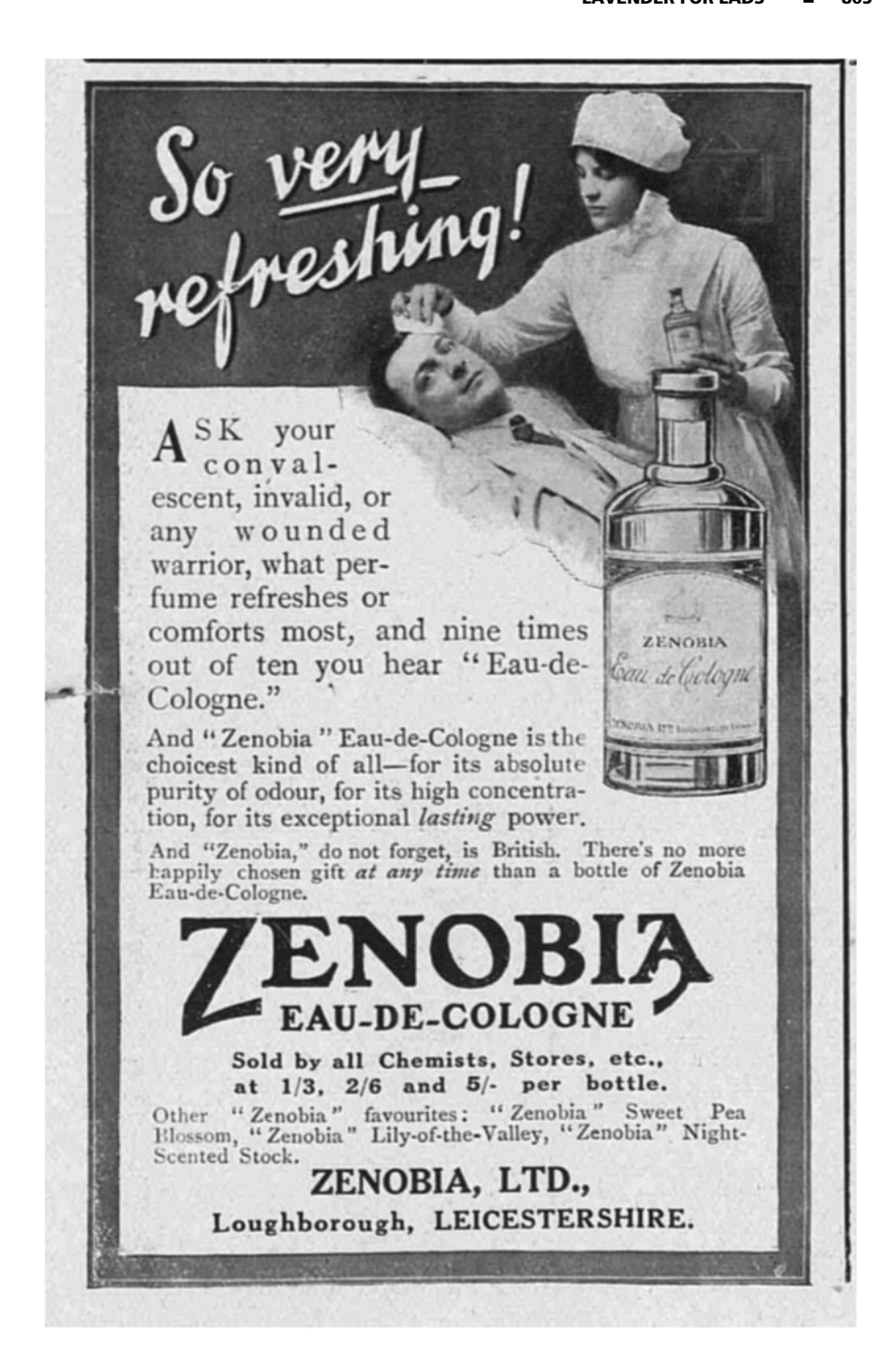
Figure 2—Advertisement for Zenobia Eau-de-Cologne, Bystander (London), 15 March 1916, 499.