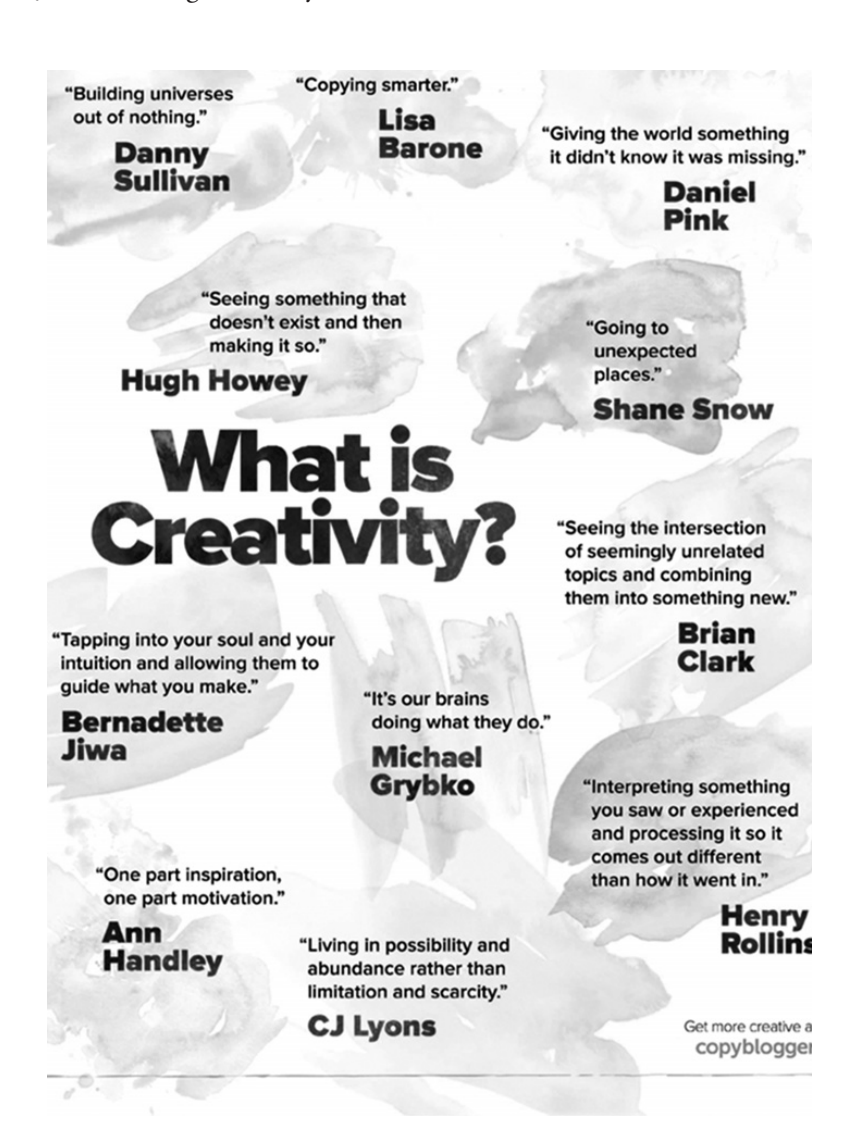
Figure 2.1 Creativity definitions (free poster from Demian Farnworth, 2021).