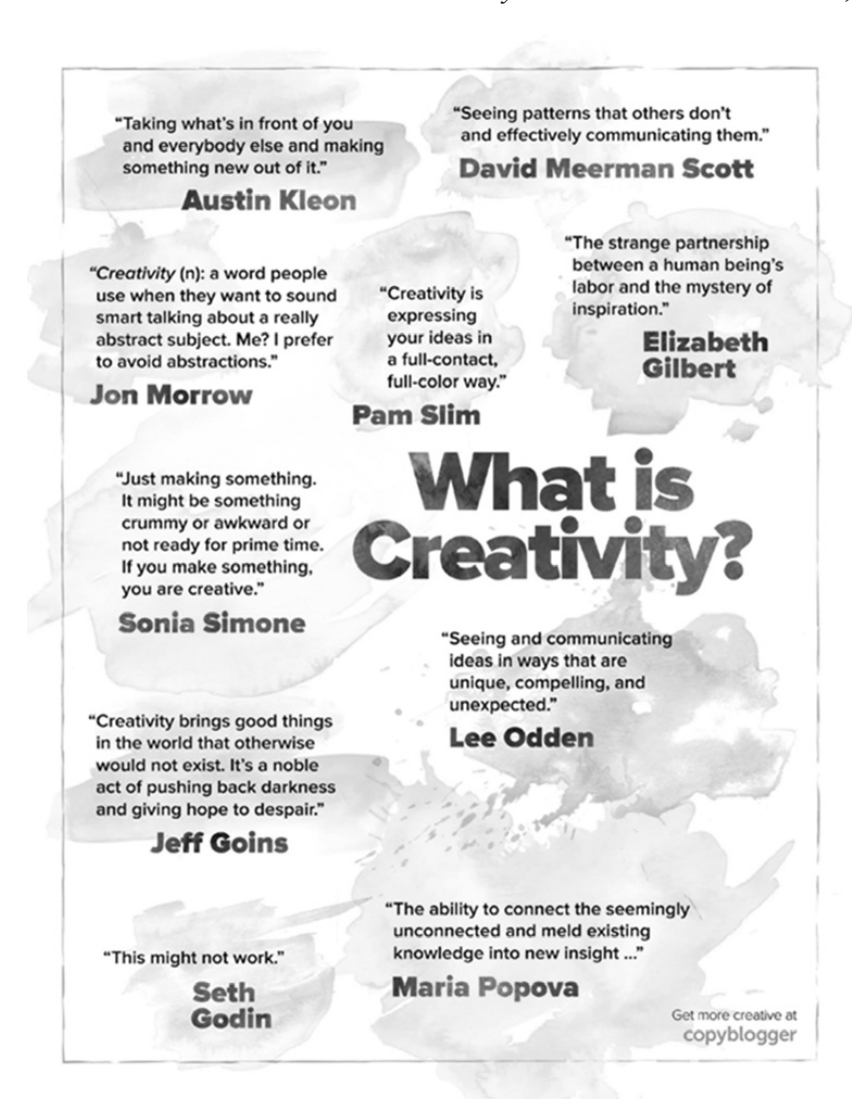
Figure 2.1 (cont.)