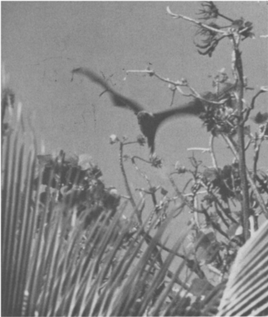
Above: Fruit bat Pteropus giganteus ariel (F. Moutou). Right, top: Cowries are sold by the thousands (F. Moutou). Right, bottom: Hawksbill turtles are sold everywhere, stuffed or as shells, despite legal protection (F. Moutou).