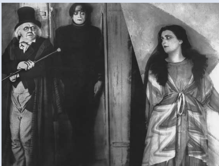
Still of evil Dr Caligari on left; somnambulist (centre) is Conrad Veidt, with Jane on right

Given this popularity and its appearance in children's animation, Jungle Book (1967) and Robin Hood (1973), hypnosis is probably the most (mis)represented of all 'psychiatric treatments' on film. It remains a popular narrative ploy, mostly in thrillers – Dead Again (1991) and the Bourne trilogy (2002–07) – where no smart money is bet on the integrity of the hypnotist. In Stir of Echoes (1999) and countless dissociative identity disorder films, hypnosis is the catalyst for libidinous mayhem. Movie hypnosis is seldom used for good ( Inner Sanctum/Calling Dr Death 1943) – as with the television news maxim, 'if it bleeds, it leads'. Its power is ferocious – in Silence of the Lambs (1991), psychiatrist Hannibal Lecter is able to induce suicide in a detested fellow prisoner whom he cannot see, separated by several layers of bars and glass. Go figure.