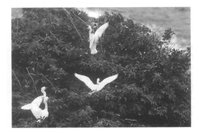
Plate 2 Family (adult and fledglings) of Chinese egrets in the colony.