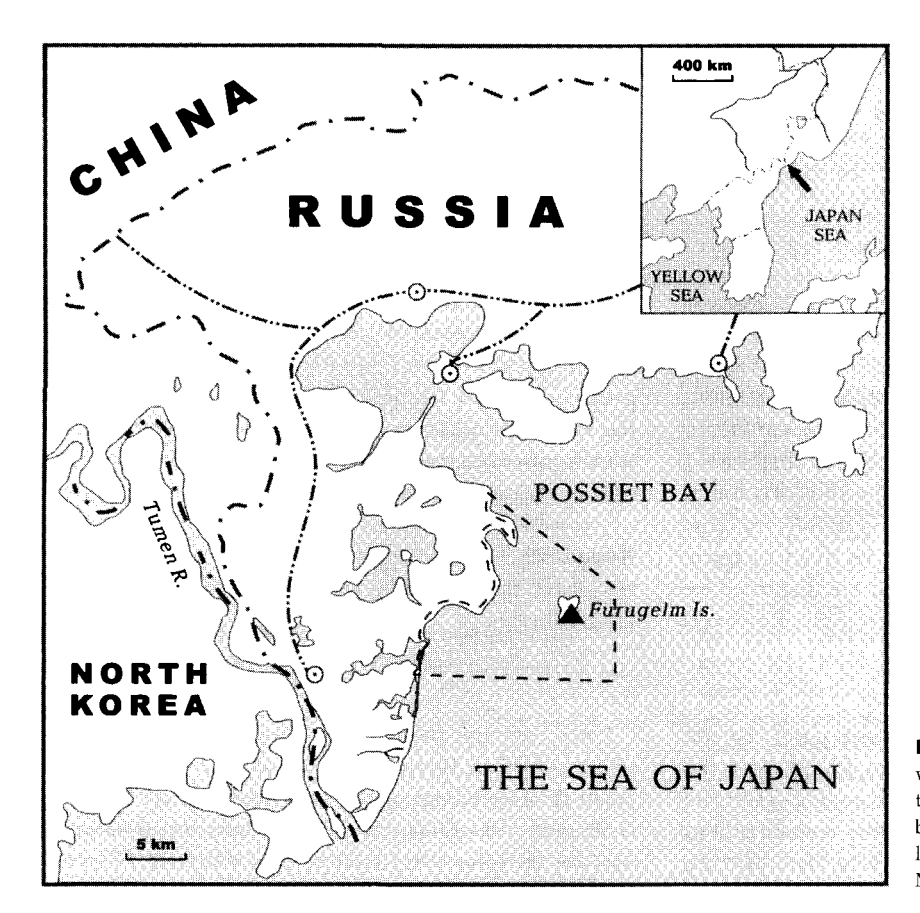
Fig. 1 Furugelm Island and its location within the Sea of Japan. Key: triangle = location of Chinese egret breeding colony; broken line = boundary of the Far-Eastern Marine Reserve.

of the Tumen River and Possiet Bay. The nearest feeding lagoons are approximately 15 km from the colony (Plate 3).