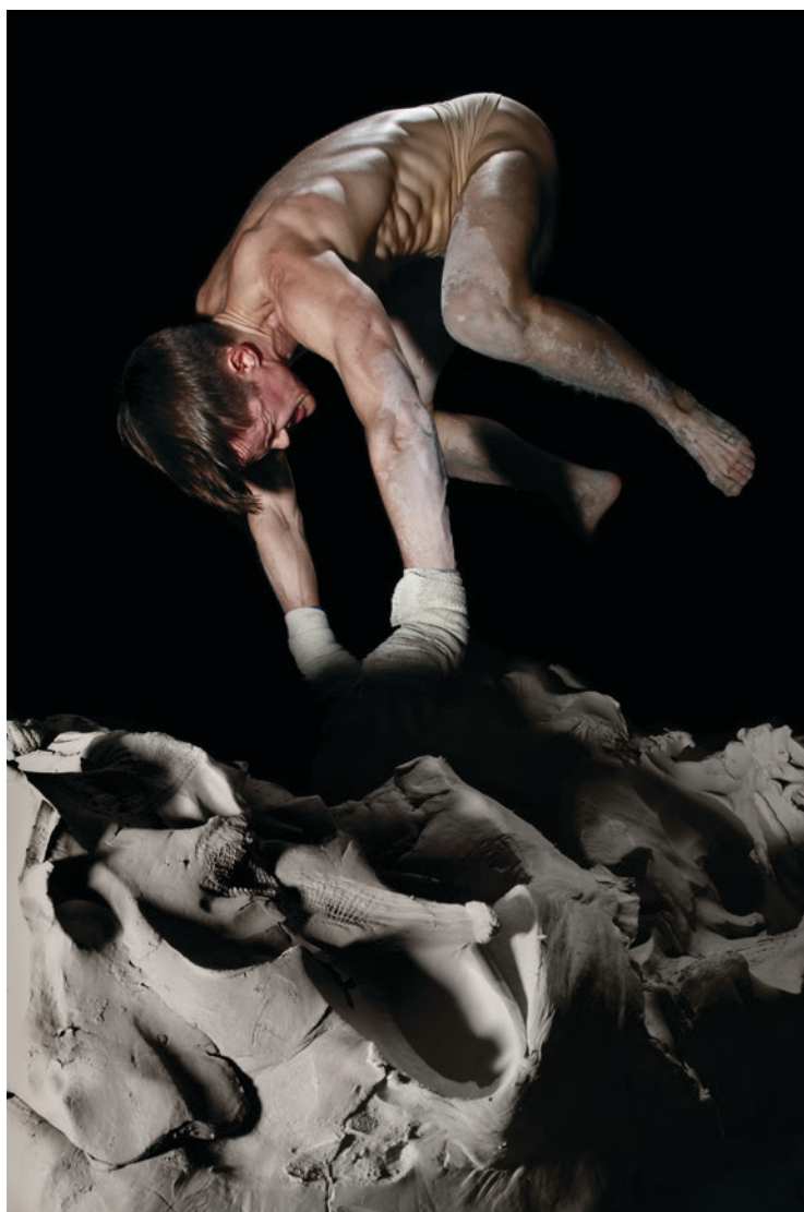
Figure 3. Cassils, Becoming An Image Performance Still No. 1. Edgy Women Festival, Montreal, 2013. c-print face mounted to Plexiglas, 36 x 24 in.

legible categories: these categories necessarily have distorting effects, because they abstract from the particular. There is a dialectical tension between distortion and revelation that mimics and is tied to the nature of value, which organizes the social in ways that can be felt but not always consciously thought or seen.