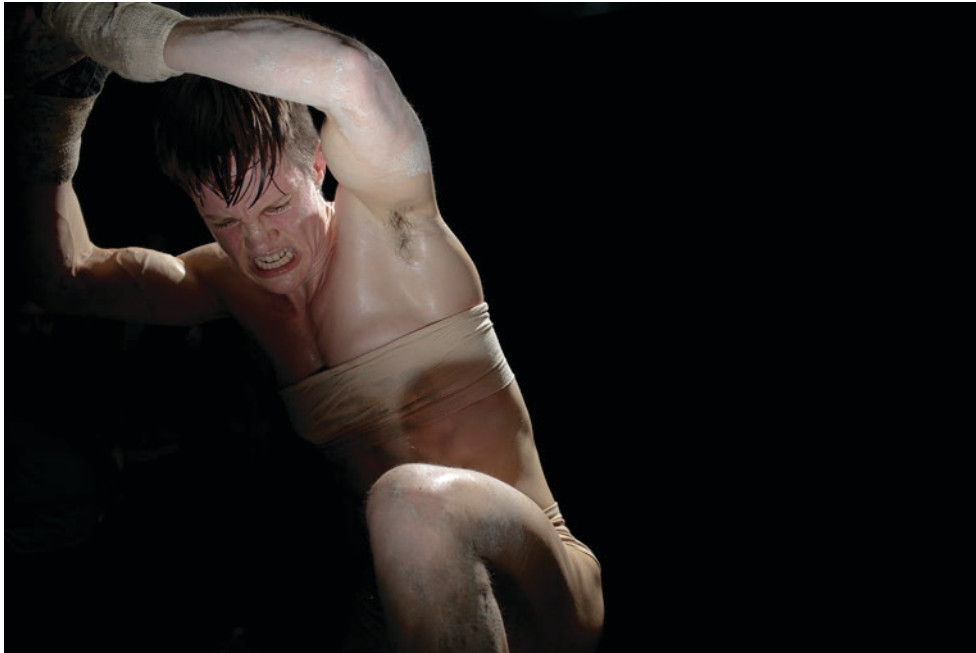
Figure 4. Cassils, Becoming An Image Performance Still No. 4 . ONE National Archives, Transactivations , Los Angeles, 2012. c-print face mounted to Plexiglas, 24 x 36 in.

this process is reversed: the artist's body imprints upon the clay block, which the artist molds and shapes. The clay (known as "Walter Elias Disney" [WED] clay because it is commonly used in the film industry for stop-motion animation and for making facial sculptures) is a dense material that cannot be fired. This means that the molded clay form, unless cast in another material, will erode over time (Getsy 2015:273). The clay's dense presence is time-bound. Cassils's body, which they imprint upon it, is also time-bound; it is also something that has been molded into form through the effort of the artist. The similarity here, between the matter of the clay and of Cassils's body, emphasizes a processual transformation that takes place through history. The performance reverses the imprinting process that we see in Mendieta's Untitled . Such a reversal indicates a reciprocal relationship between matter and abstraction: gender is an abstraction that concretely determines the body, but this relation is not fixed or one-directional, abstractions (like gender, and value) emerge through historically and materially situated social relations.