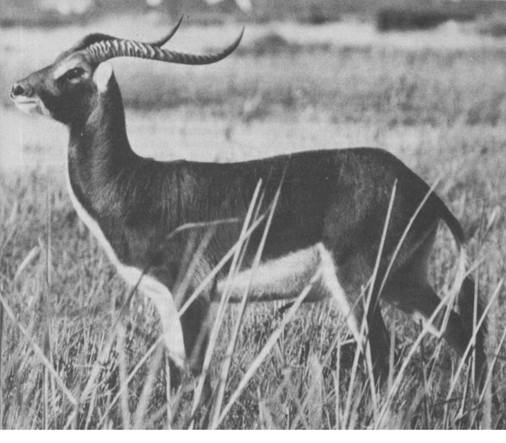
Male BLACK LECHWE, and below a SITATUNGA disturbed from his wallow by the aeroplane