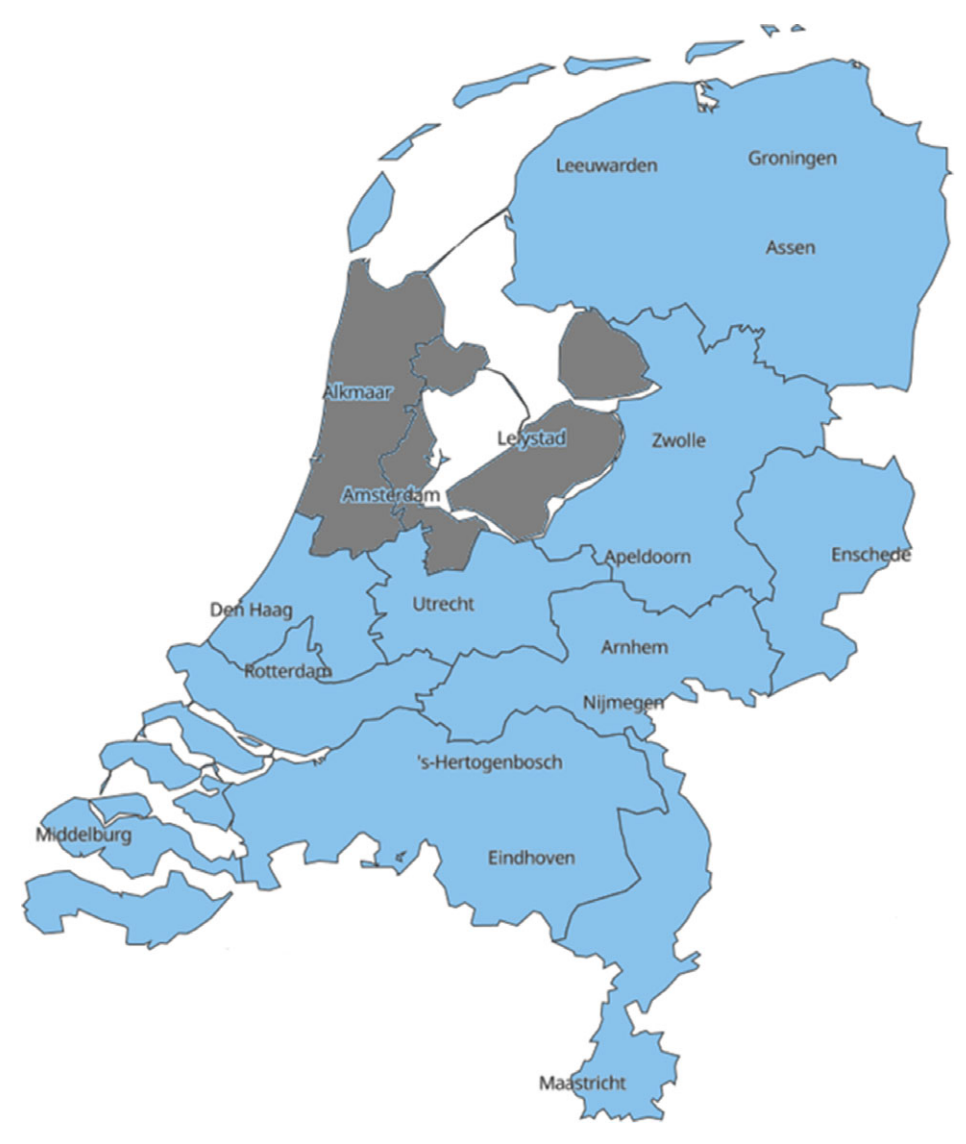
Figure 1. Eleven ROAZ regions in the Netherlands; ROAZ region Noord-Holland, Flevoland is highlighted in gray.<sup>20</sup>

involved and the possibility to timely decide for patient transfer. <sup>15</sup> Full transparency among all levels ought to be of great importance. <sup>17</sup>