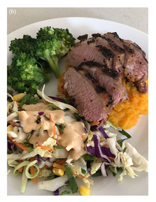
Fig. 3 (a) Eating is a social activity during night shifts. In the hospital setting, staff would set up grazing platters at the main nurses' station, where they would gather during their breaks (Nellie). (b) Having social network was associated with participants' motivation to prepare food. Susan prepared dinner for her family and set aside a serving to be brought to work.

Participants expressed being exhausted after night shifts and would often eat something that was quick and convenient (for example, Fig. 4) or skip meals, so they could get to bed as soon as possible and maximise their sleep opportunity.