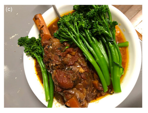
Fig. 5 (a) 'Meal prep' done prior to night shifts, using grocery delivery service. Nellie added extra vegetables into the dish, quoting the importance of a 'balanced' meal. (b) Samuel's perception of a 'healthy meal', with vegetables, meat and grain foods. (c) Dinner that Susan prepared using a slow cooker. Those who enjoyed cooking had knowledge of 'shortcuts' that could be used to reduce food preparation time.

do grocery shopping on his first day-off and was prepared to make dinner. However, he 'hit a wall' and resorted to food delivery. The effect of 'shift work hangover' was more apparent in rotating shift workers compared with permanent night workers. This was likely due to constant changes in shift types and structure of rosters, which allowed little time for recovery in between and after a block of shifts.