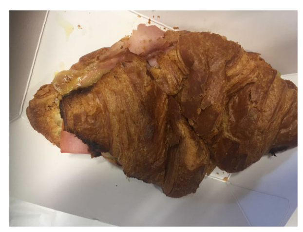
Fig. 2 'Front loading' food and caffeine was common, if meal breaks were expected to be delayed. (Nathan)

on a day shift, 'Your options are better, because if you don't bring your food, you can just go and get something that's not too bad?' In comparison, all cafés near her workplace are closed during the night, therefore, 'By the time I could go and get something to eat, it was KFC'.