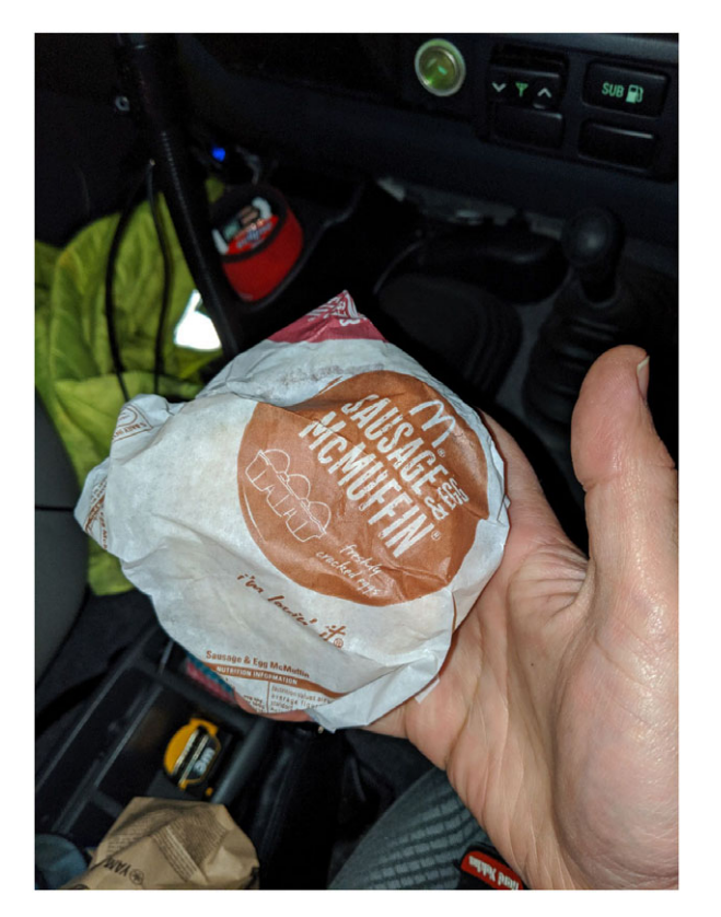
Fig. 4 Samuel chose a convenient food option, consumed during the commute home after a night shift, so that he could get to bed as soon as possible.

Fatigue accumulated during a block of night shifts would often extend into participants' rostered days-off. Participants reported requiring the first couple of days-off to recover; their eating habits were subsequently affected. Evidenced by Nellie's experience, 'My first few days after a lot of night duties, my body clock is still out-of-whack... Even during my days off after night duties, it takes a little