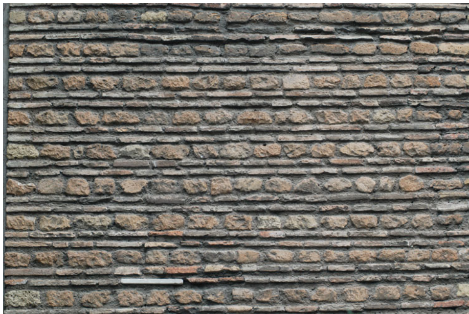
Fig. 1. Sant' Agnese, north side of nave, exterior.

consists of repeating courses of brick and small, roughly rectangular blocks of cut stone (called tuffelli in Italian) fashioned from one of the local varieties of tuff. The materials used are fairly homogeneous, and the courses tend to be reasonably level and evenly spaced. Usually one, but sometimes two or more courses of tuffelli alternate with one or more courses of brick in generally regular order. Two courses of brick follow one of tuffelli at Sant' Agnese (Fig. 1); at San Pancrazio, single courses of tuffelli and brick alternate (Fig. 2), as they do at San Venanzio (Fig. 3). 4 The technical characteristics of all three are broadly similar to those of numerous structures built in the preceding centuries, among them the fourth-century House of Cupid and Psyche at Ostia (1 tuffelli /2 brick); the early-fifth-century church of San Vitale (1 tuffelli /1 brick in the walls of the nave and facade (Fig. 4); 1 tuffelli /2 brick on the facade of the narthex); and the late sixth-century church of San Lorenzo fuori le Mura (1 tuffelli /1 brick; Fig. 5), to name but a few. 5