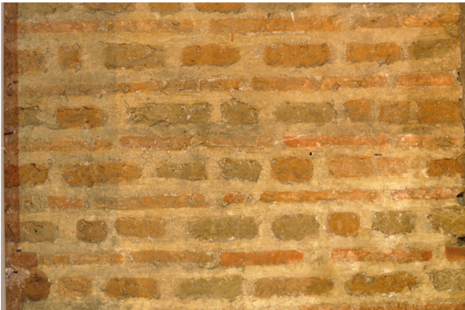
Fig. 5. San Lorenzo fuori le Mura, nave, interior.