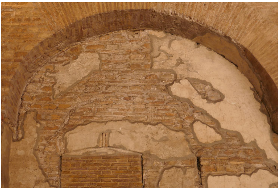
Fig. 3. San Venanzio chapel, interior: seventh-century masonry blocking fourth-century arcades.