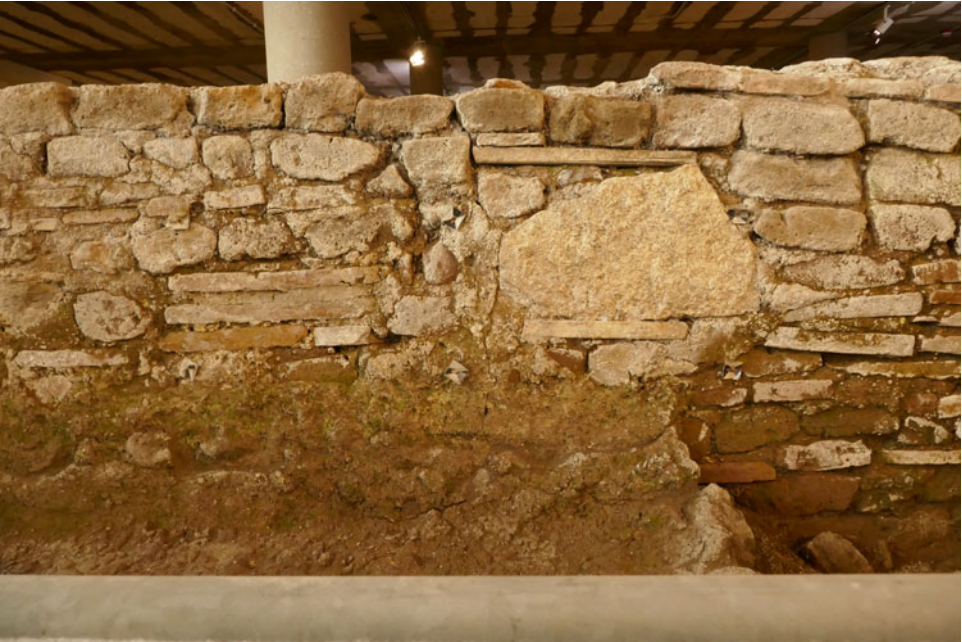
Fig. 8. Standing masonry from the first phase of Gregory II's monastery at San Paolo fuori le Mura.