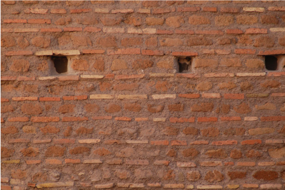
Fig. 4. San Vitale, apse, exterior.