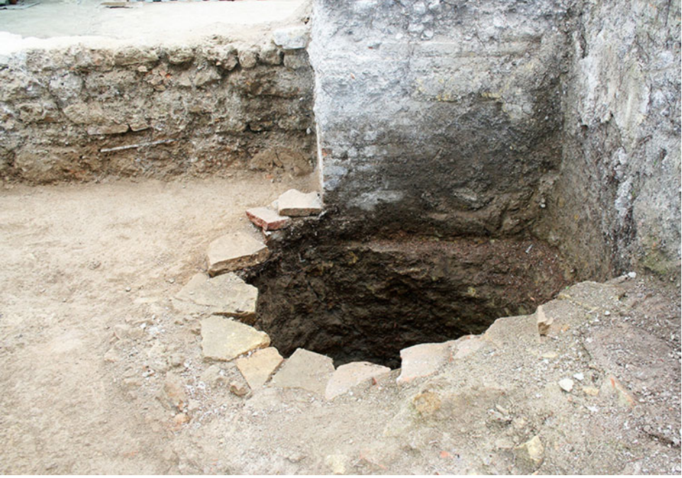
Fig. 7. Early eighth-century masonry at the Domus Tiberiana (at upper left; this is building 'a' in Fig. 6).