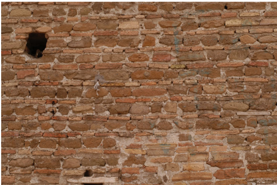
Fig. 2. San Pancrazio, apse, exterior.