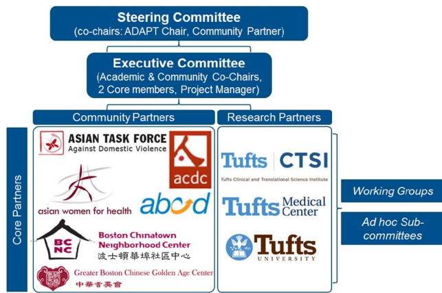
Fig. 3. Addressing Disparities in Asian Populations through Translational Research (ADAPT's) governance structure.

expand its engagement with diverse stakeholders and bring in new members while honoring the time and commitment made by those who have been involved for a long time. Monthly Steering Committee meetings have continued since ADAPT's inception. The meetings are open to anyone interested, and the attendance includes both members of the Steering Committee, other (affiliate) members, trainees, and interested faculty and community.