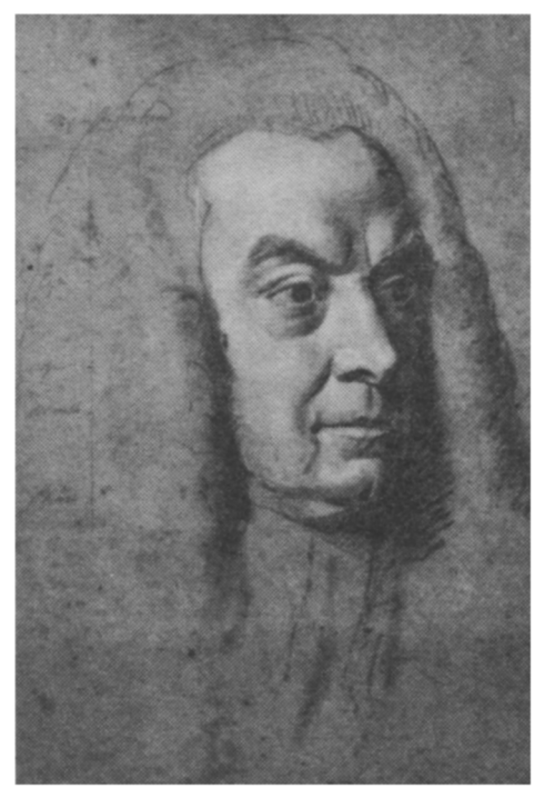
Library of the Boston Athenaeum