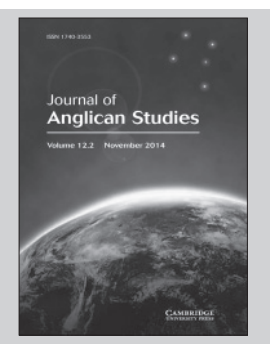
Journal of Anglican Studies is available online at: http://journals.cambridge.org/ast

Journal of Anglican Studies provides a serious scholarly conversation on all aspects of Anglicanism. It embraces history, theology, worship, ethics, scripture, canon law, aesthetics and education. With its international reach, the Journal is able to focus on the position of Anglicans within many different cultural contexts, offering a unique contribution to our understanding of Anglicanism today.