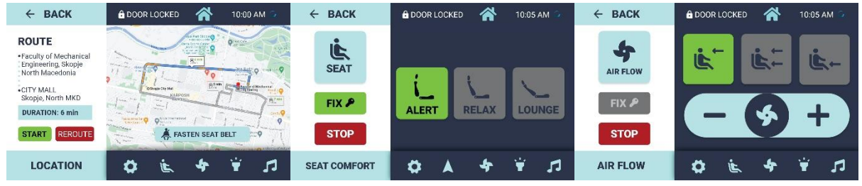
Figure 2. UI wireframe variant no.1

Variant no.1 (Figure 2) was designed with header bar and a menu bar with a same height. The menu bar was placed at the bottom of the screen and contained only icons to represent the available options. The left third of the UI grid was used to display information and the central two thirds of the screen were used to display the content of the different menu options. For example, the navigation showed a large map, the seating adjustment showed buttons for choosing a preferred seating position etc. The map was only visible if the person user clicks on navigation. Messages (information and notifications) only appeared as pop-up windows.