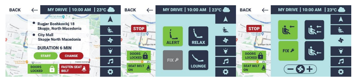
Figure 4. UI wireframe variant no.3