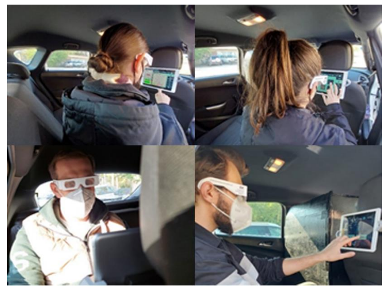
Figure 6. Users interacting with the developed UI

After the experiment, structured and semi-structured questionnaires were given to each participant in order to gather their impressions. They were also encouraged to explain their answers and provide additional comments or ideas. The gathered results are elaborated in the next section.