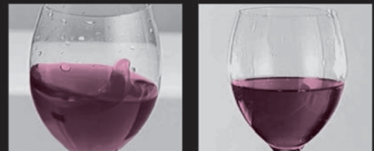
Without Minus K