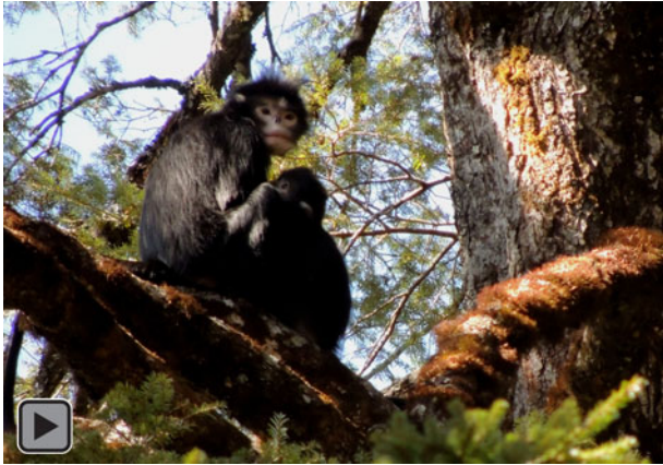
PLATE 1 Mother and infant of Rhinopithecus strykeri in the newly discovered population in Luoma, China, near the border with Myanmar (Fig. 1).

outside the Reserve, close to Chengan township, where they may occasionally be hunted by the Lisu people (Ma et al., 2014). The border of the reserve may therefore need to be adjusted to ensure the full protection of the population. We aim to conduct further research and to develop a conservation action plan to protect nearby forests, which also harbour other threatened species, such as the Endangered red panda Ailurus fulgens styani , Vulnerable Mishmi takin Budorcas taxicolor taxicolor , and Vulnerable Sclater's monal Lophophorus sclateri . In addition, further surveys to locate other potential R. strykeri populations and to determine accurately the population size in the Sino-Myanmar region are required for a full assessment of the conservation status and needs of this Critically Endangered primate.