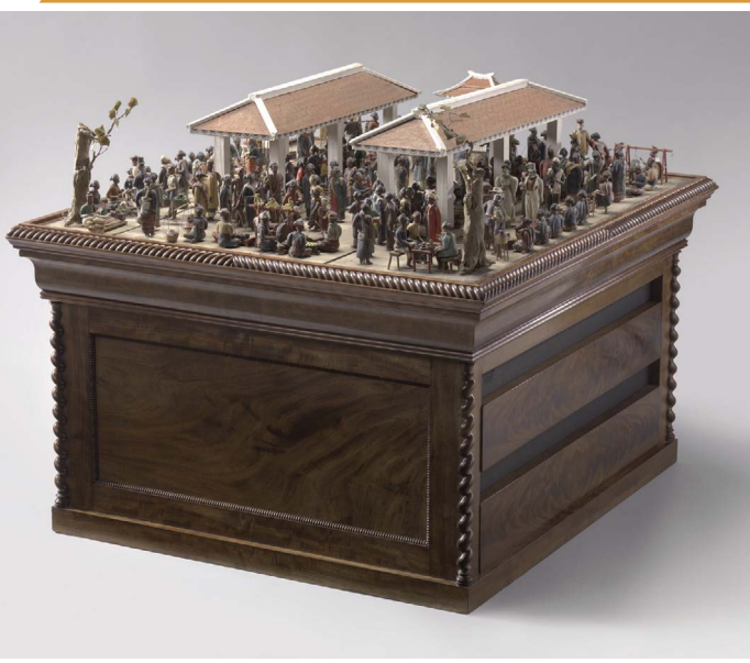
Javanese market, c. 1830-1860, anonymous. Model of a double market gallery consisting of Javanese pendopo pillars and Dutch roof tiles, intended as souvenir for European travelers.

For further information: www.itinerario.nl