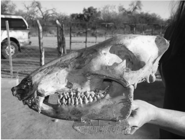
PLATE 2 Skull of a Chacoan peccary hunted by local people in Pinas, west of Córdoba province, Argentina, in 2003.

region covered by the IUCN polygon, it is possible that the population in Córdoba is not isolated. There is continuous forest linking both areas, as shown by the most recent land cover classifications (Morales Poclava et al., 2007; Clark et al., 2010), with climatically suitable conditions (Torres & Jayat, 2010).