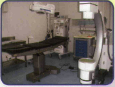
Inside OT in KATIKO Referral Hospital