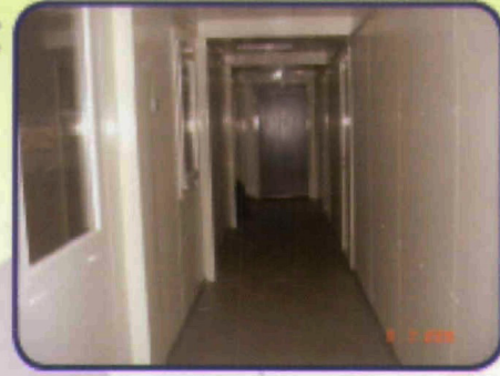
Inside MSF Hospital in Hattian Bala

Number One in the world within partly and turn key solutions incl. Transportation, Erection, Management, Training, Maintenance, Education, Administration, Storage, Out sourcing, Medivac, etc.