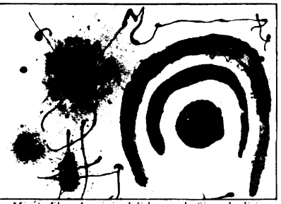
Joan Miro's Flore I, original lithograph. Signed edition of 50.

In your own home, you can exhibit original work by artists who are represented in the world's great museums and galleries.