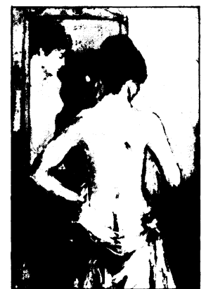
Jan de Ruth's Reflections , original serigraph. Signed edition of 200.