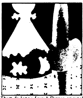
nom de Jong's French Dinner, original etching: Signed edition of 175.